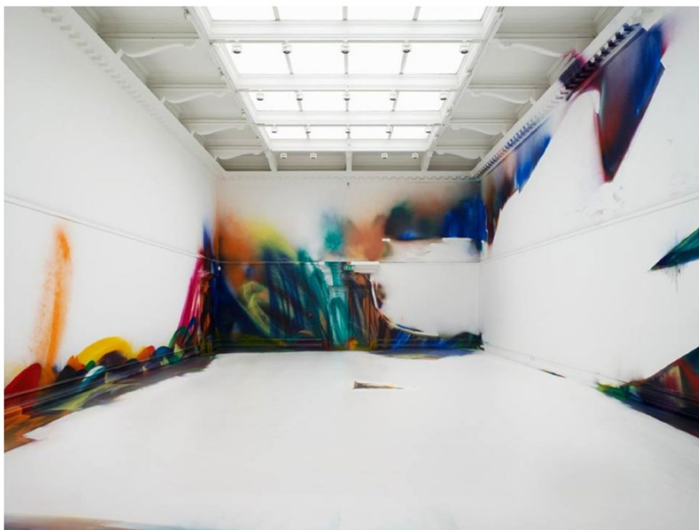
This Drove My Mother Up The Wall (2017)