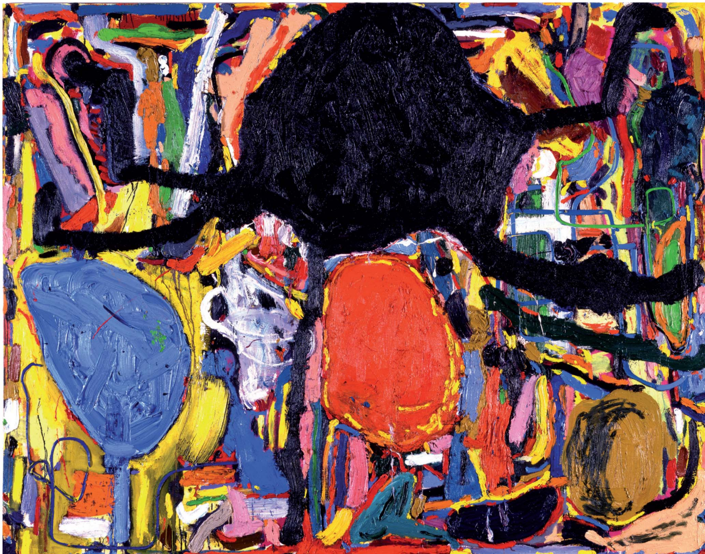
ANDRÉ BUTZER, Nicht fürchten! (2) / Don't Be Scared! (2) , 2010. Oil on canvas, 221 x 280 cm. Courtesy Metro Pictures, New York.

ture. This question may seem more of an observation, but I would like for you to expand on this recent exploration of yours.