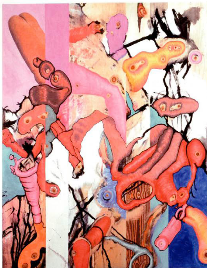
Carroll Dunham: Big Pine , 1981-83, mixed mediums on pine, 62 by 48 inches.