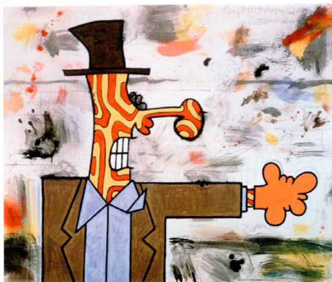
Orange Glove , 2000, mixed mediums on canvas, 50 by 59 inches.