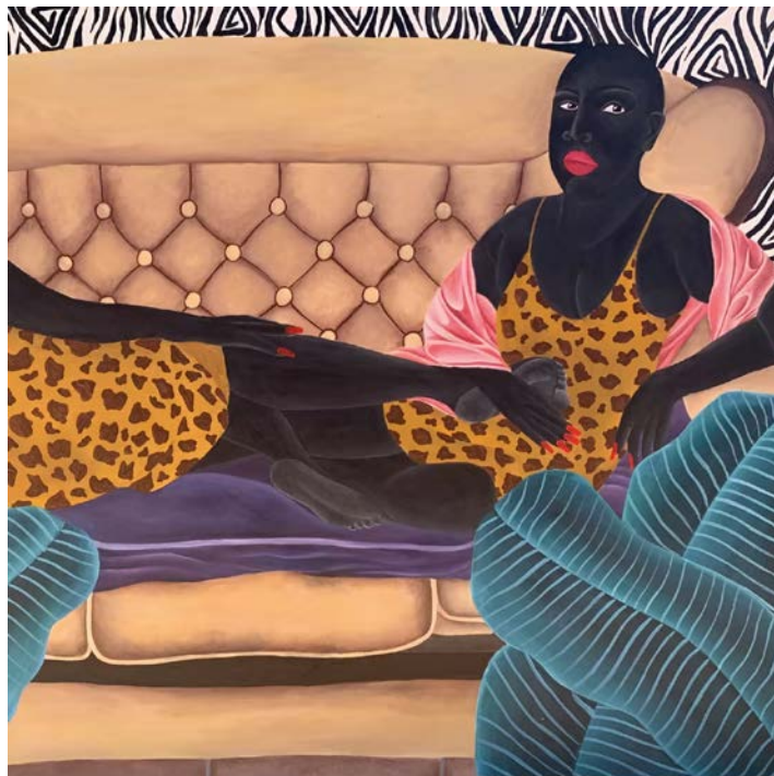
Two Reclining Women, 2020, by Zandile Tshabalala