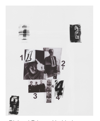
Richard Prince, Untitled (1,2,3,4), 2016