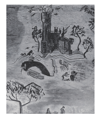
Rudolf Stingel, Untitled (Bemelmans), 2016