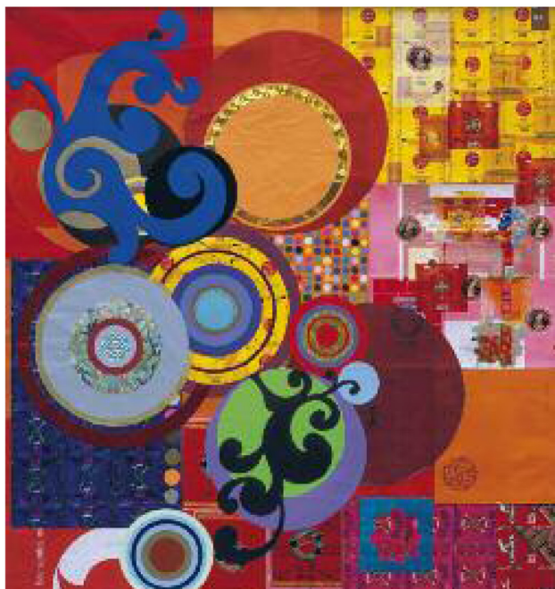
Beatriz Milhazes, Ouro Branco , 2006 Mixed collage on paper, 61.2 x 58.4 in / 155.5 x 148.5cm

BM True. At the beginning, my work was neither directly interested in nor connected to it, but it certainly bore the effects of the Brazilian folk culture in a plastic way, on the visual result. It took some time before I arrived at the things I actually wanted to make. When I was at school, I wanted to establish a link between my culture and what I had always been and the painting. I think that was the greatest challenge, because painting is a serious undertaking; and back then, to be a serious painter, the work always had to be associated with meaning originating from Europe, and later on, from the United States, but not from Brazil. Yet for me, Brazil was a zone of meanings, of captions. These did not necessarily have a connection with the outside world. So in my case, I wanted to establish a connection to my work, because in reality, my life and my culture have nothing to do with painting. But how could I connect it in an interesting way? And thus the carnival became a part of it. Because I have always loved the way Brazilian people live it. In Brazil, the carnival develops differently in every state, every place. In reality the carnival is something magnificent. I am not really into carnival; I don't go out on the street and dance. But I have always been a really huge admirer of the way they develop the carnivals and of this freedom they enjoy. They mix completely different things. They always have teams of samba from every school each year.