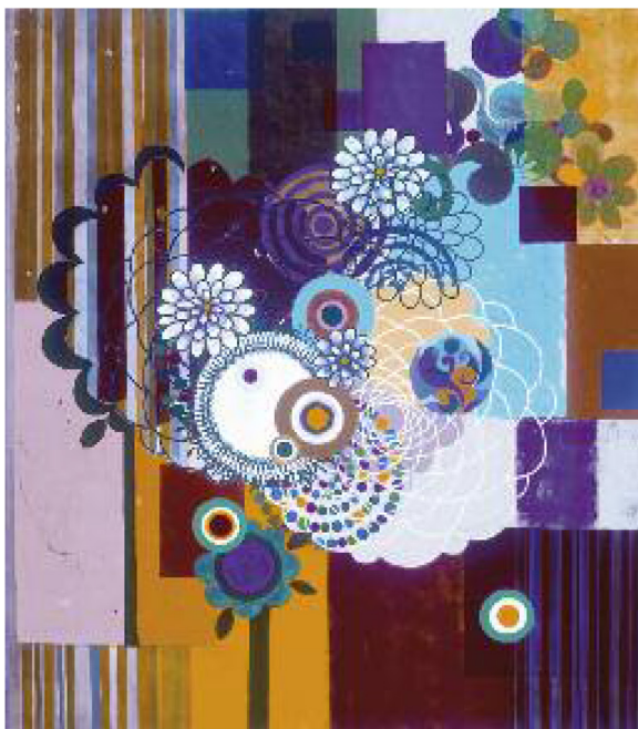
Beatriz Milhazes, Panamericano, 2004 Acrylic on canvas, 77.9 x 70.4 in / 198 x 179 cm