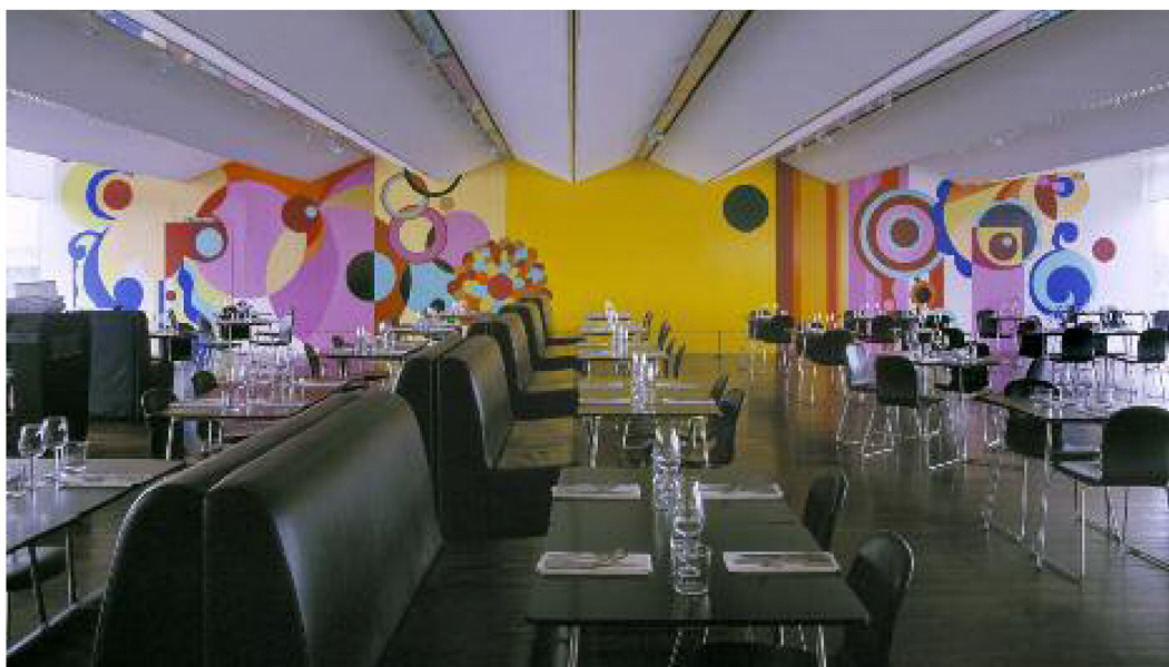
Beatriz Milhazes, "Guanabara", Tate Modern Restaurant Project. Tate Modern, London, UK, 2005 Vinyl adhesive on wall. Panel 1: 682.6 x 145.2 in / 17.34 x 3.69 m, panel 2: 453.5 x 145.2 in / 11.52 x 3.69 m