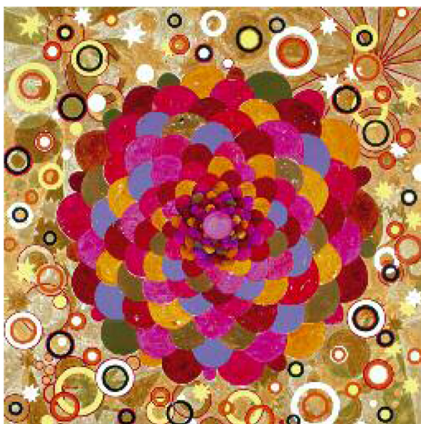
Beatriz Milhazes, Nega Maluca, 2006 Acrylic on canvas, 98.2 x 98.6 in / 249 x 250.5 cm

Collection: Douglas Andrews, Italy