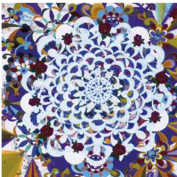
Beatriz Milhazes, O popular, 1999 Acrylic on canvas, 70 x 70.8 in / 178 x 180 cm

Collection: Douglas Andrews, Italy