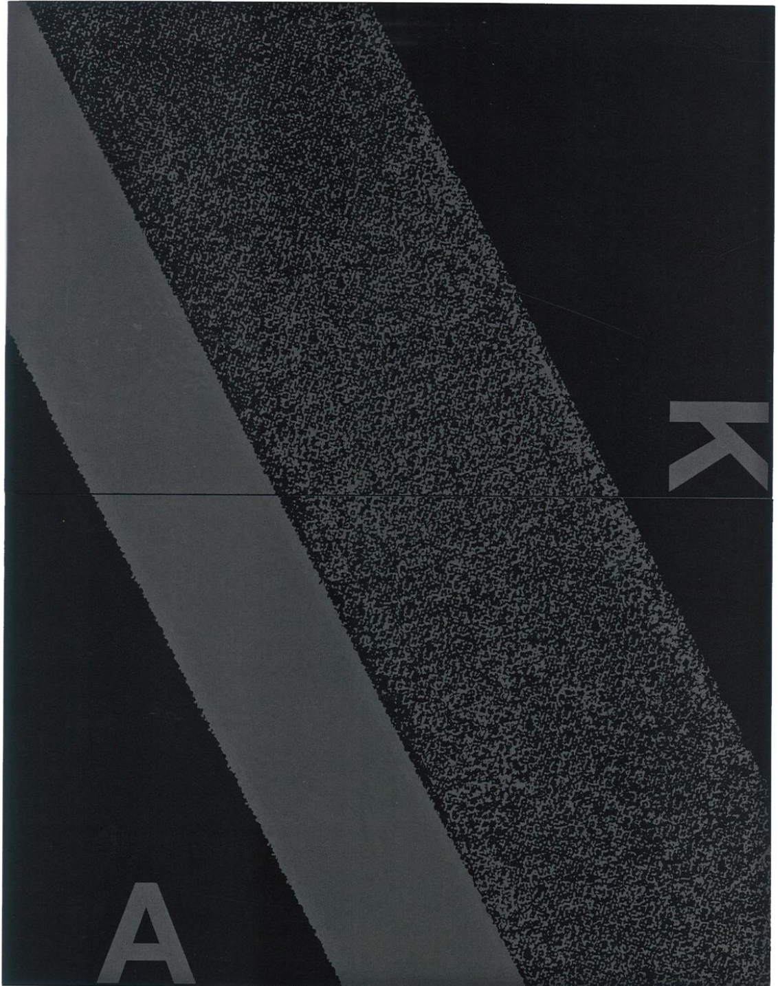
Black Dada (K/A) , 2012, silkscreen ink on canvas, diptych, 96 by 76 inches overall.