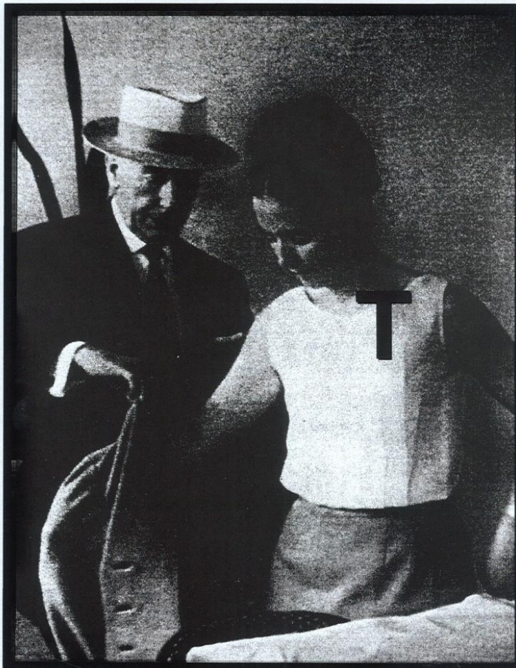
System of Display, T (NIGHT)/Jean- Marie Straub, Not Reconciled, 1965), 2011, silkscreen ink on glass and mirror, 63% by 48% inches.