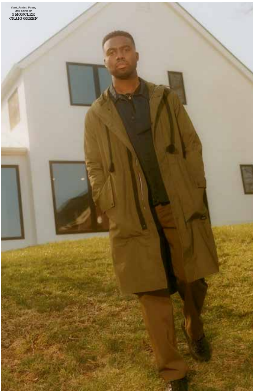
Coat, Jacket, Pants, and Shoe by 5 MONCLER CRAIG GREEN