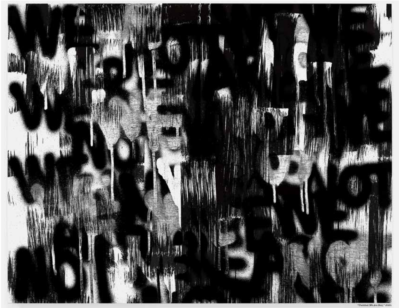
"Untitled (We Are Not)," 2020.