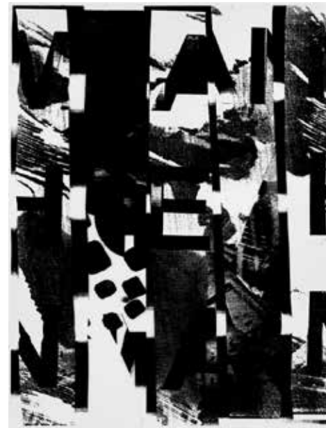
“A woman on the train asks Angela Davis for an autograph,” 2014.