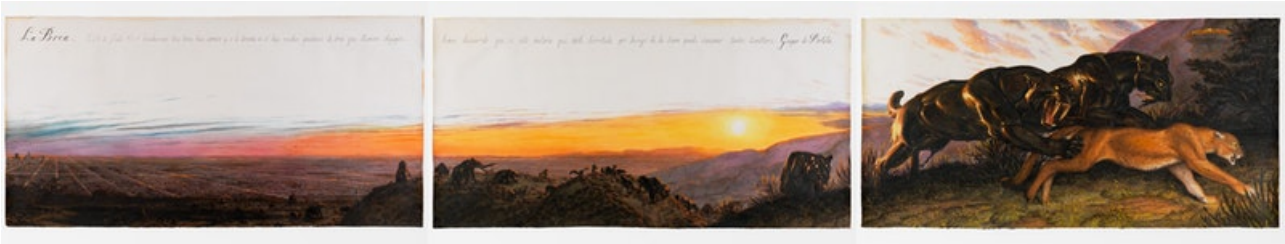
Walton Ford, La Brea , 2016. Watercolor, gouache and ink on paper. 60 1/2 x 119 1/2 inches 153.7 x 303.5 cm (unframed) © Walton Ford.