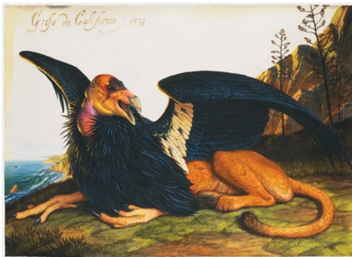
Walton Ford, Grifo de California , 2017, Watercolor, gouache and ink on paper, 60 1/4 x 83 3/4 inches 153 x 212.7 cm (unframed) © Walton Ford. Photography by Christopher Burke. Courtesy Gagosian.

Walton Ford's new exhibition of customarily grand watercolors at Gagosian Beverly Hills is titled Calafia , after the warrior queen in Garci Rodríguez de Montalvo's Spanish novel Las sergas de Esplandián ( The Adventures of Esplandián ). Printed in 1510, it imagines the early history of the American Pacific coast, and a race of African warrior women accompanied by a fierce army of man-slaying griffins residing on the fabled island of California. The grandiose triptych titled La Brea is a thirty-foot long, horror film-worthy panoramic view from the Hollywood Hills of resurrected prehistoric beasts rising out of the ebony ooze of the famed tar pits, either setting off downhill for the city or barreling into the canyons, with neon-eyed saber-toothed cats attacking an unsuspecting mountain lion. Other ripping works deal with the tragic history of the California grizzly and, in Ars Gratia Artis , a gone-to-seed MGM studio lion mascot lounging drunkenly at night by a swimming pool. Senior Rail writer, Jason Rosenfeld, met Walton Ford at his studio in New York to talk about these new paintings.