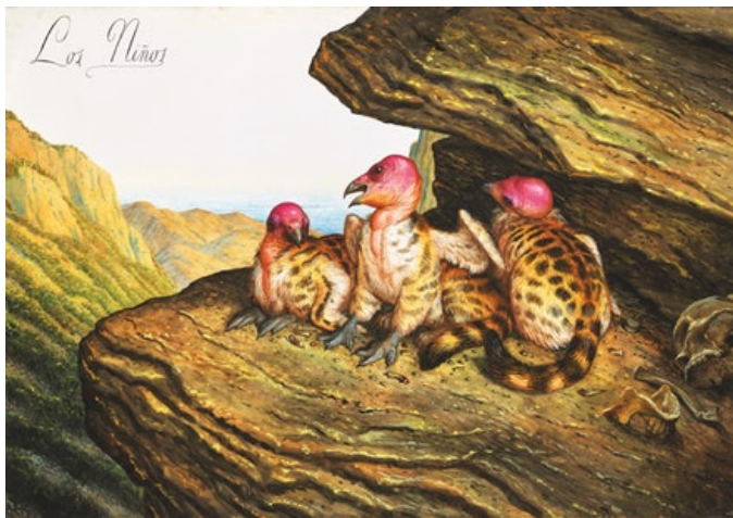
Walton Ford, Los Niños , 2017, Watercolor, gouache and ink on paper, 41 5/8 x 59 5/8 inches (105.7 x 151.4 cm) © Walton Ford.

Ford: And Edward Lear, and any number of natural history artists, especially the studies they did from life or from a dead specimen. They would've had notations because it was going to later be a lithograph or an engraving—like field notes, the ephemera of exploration, the ephemera of journal entries by explorers of Africa and the Amazon. Those are the things that really excite me.