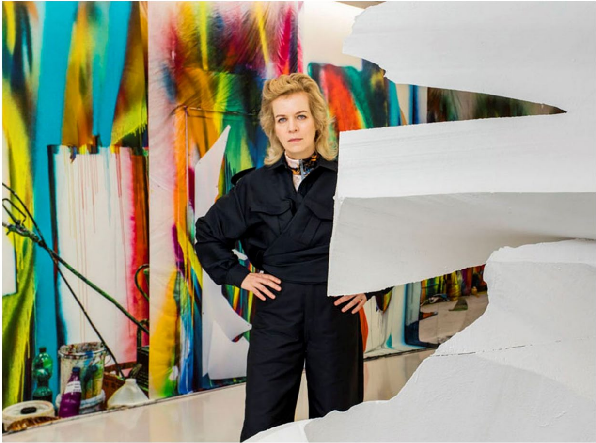
Katharina Grosse. Courtesy K11 Art Foundation and Galerie Nächst St. Stephan, Vienna. © Katharina Grosse and VG Bild-Kunst, Bonn.