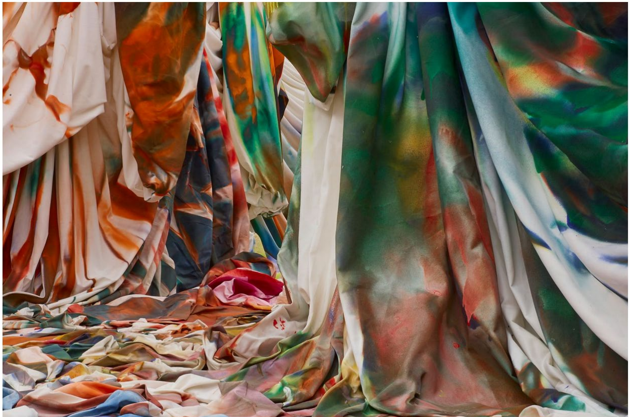
Exhibition view: Katharina Grosse, Mumbling Mud, chi K11 art space, Guangzhou (30 March–2 June 2019).