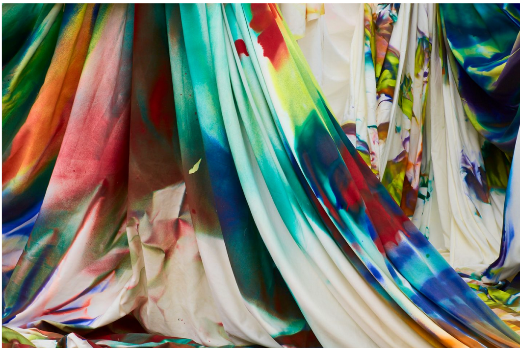
Exhibition view: Katharina Grosse, Mumbling Mud, chi K11 art space, Guangzhou (30 March–2 June 2019).

Yes, especially with the large outdoor works and their tendency to expand almost in slow motion. Painting makes possible the simultaneity of imagining and acting in an unusual way, because there is no transmitter between me and my tools. Unlike any other medium, painting allows us to see different moments in time coinciding. You can perceive everything on the canvas at the same time. Movements that have been painted first and last are both simultaneously present on the image field. All the layers on the surface generate a cluster of the present, past, and future. There is no linear or causal hierarchy of activities in a painting. In that respect, painting is very anarchic and antinarrative. To follow this concept of time, it requires a mind that is agile and ready to give up an adopted point of view at any moment for the next potential constellation or reading. Everything can become anything at any minute.