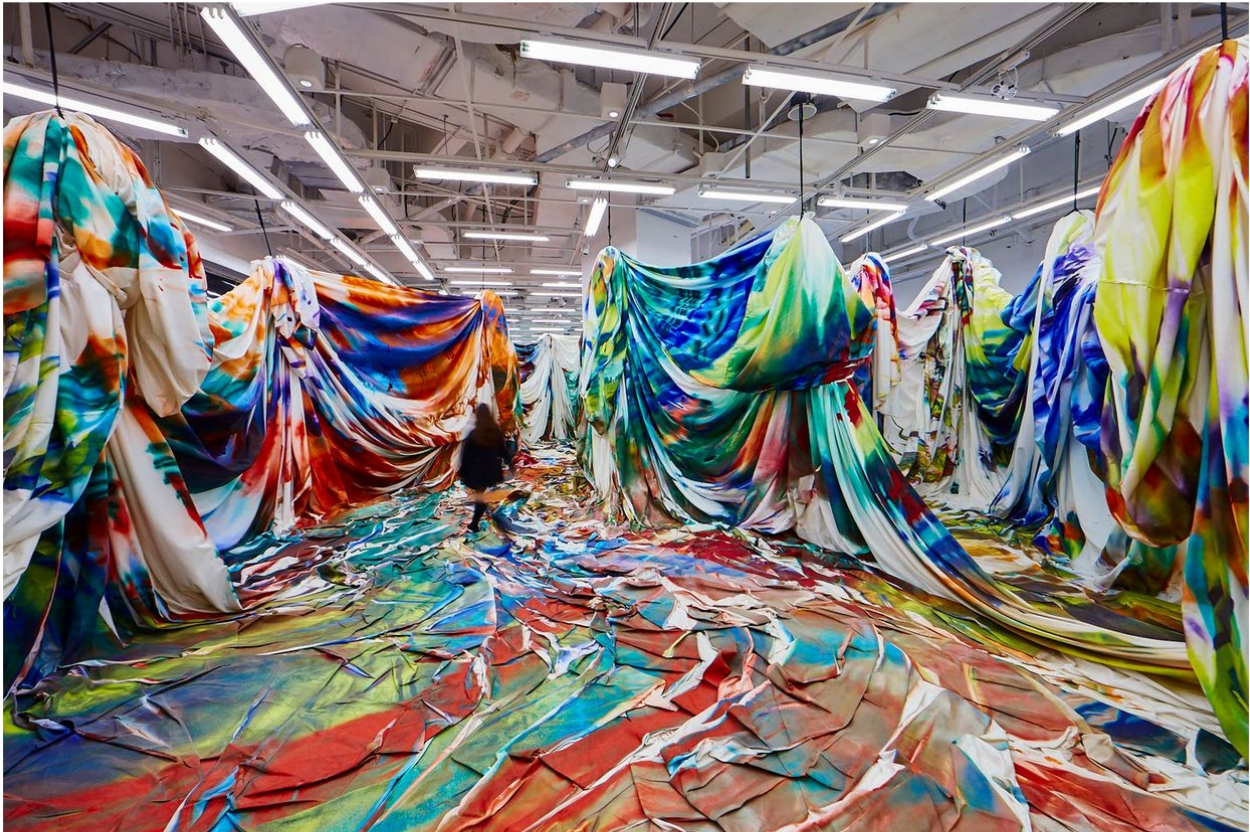
Exhibition view: Katharina Grosse, Mumbling Mud, chi K11 art space, Guangzhou (30 March–2 June 2019).

Surrounded by abstracted colour, anchor points of reality are elusive. The viewer becomes untethered from the everyday and must negotiate unfamiliar terrain. Grosse encourages viewers to explore and navigate this new landscape, urging them to let their rigidity of routine slip away. In the ever-expanding Pearl River Delta metropolis of Guangzhou, Mumbling Mud disrupts the monotony of the mundane and compels viewers to return to reality with fresh eyes and a new perspective.