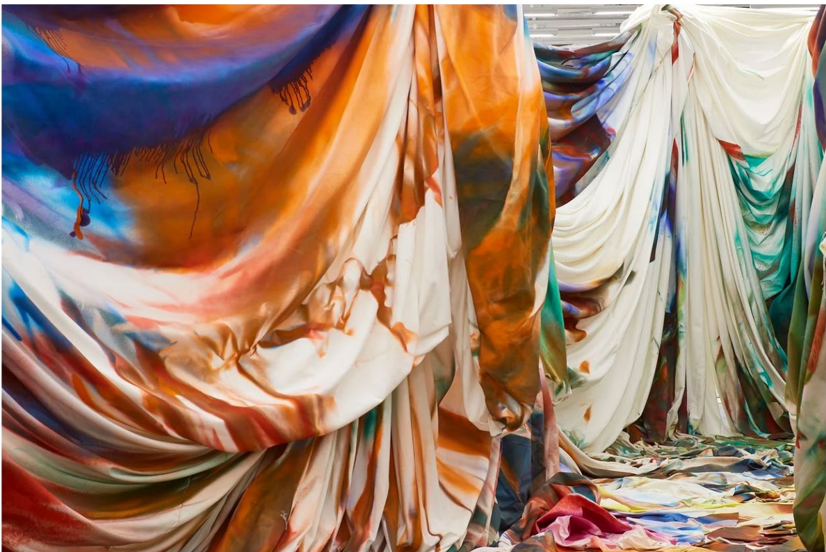
Exhibition view: Katharina Grosse, Mumbling Mud, chi K11 art space, Guangzhou (30 March–2 June 2019).

Borders are spaces of negotiation that have to be created again and again. My works provide models for thinking through border-spaces. How would it be if the borders of objects were not so binding for us? If it were possible for objects to be redefined, to be newly materialised by a constant change of perspective? Would we then not encounter our loved ones, neighbours, strangers, or the community differently?