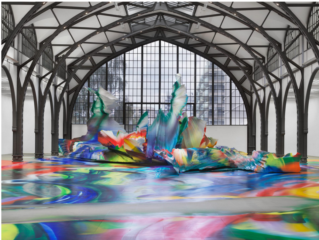
“Katharina Grosse. It Wasn't Us“, exhibition view Hamburger Bahnhof – Museum für Gegenwart – Berlin, 2020 / Courtesy König Galerie, Gagosian, Galerie Nächst St. Stephan Rosemarie Schwarzwälder © Katharina Grosse / VG Bild-Kunst, Bonn 2020