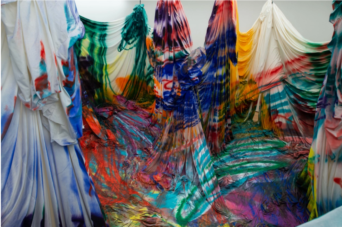
Katharina Grosse, "Is It You?," 2020, The Baltimore Museum of Art, USA, Photo: Mitro Hood, courtesy of The Baltimore Museum of Art ©2020 Katharina Grosse and VG Bild-Kunst, Bonn, 2020.