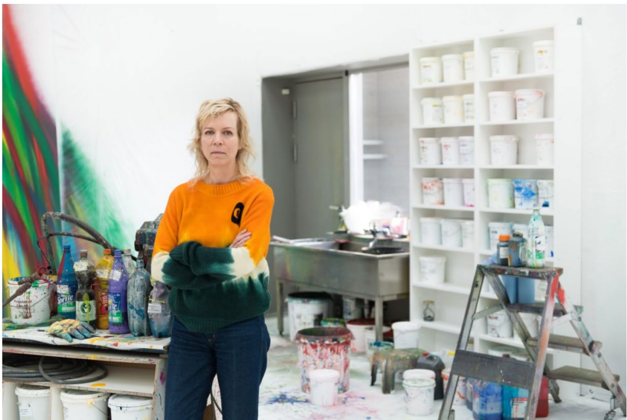
Portrait Katharina Grosse