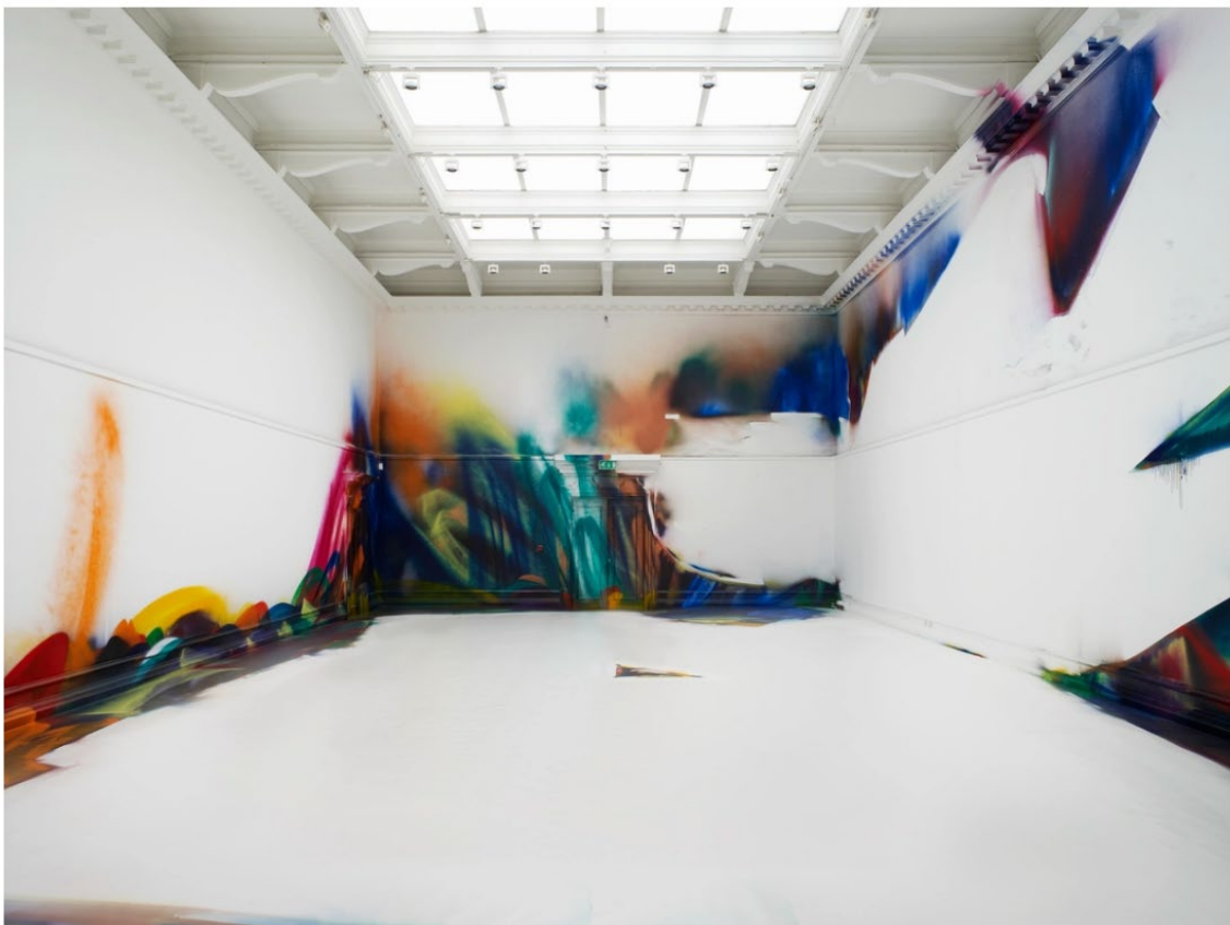
Katharina Grosse, "This Drove my Mother up the Wall", 2017, South London Gallery, London, UK.

I didn't realize the problems of being so dominated by patriarchal thinking until I left art school. The way I grew up and the friends of my parents never gave me that feeling. It was the same during art school and university. Perhaps I was shielded from it, in a way. A lot of my female friends did say to me, though, "Hey, are you crazy? Either you go into performative or video art, new fields primarily taken up by women. Painting is so overloaded by patriarchal structures. How will you be successful?"