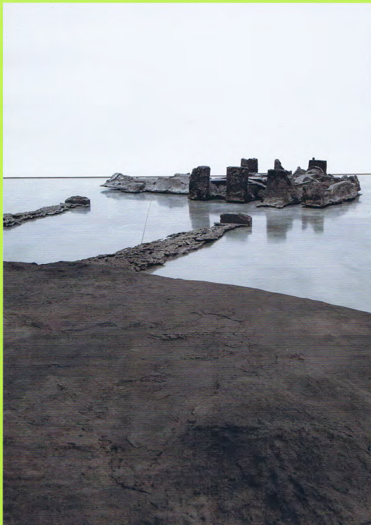
Installation view of DJED , 2011. Cast iron and graphite blocks.

MB: Yes, I think what you were saying earlier about the relationship between the museum and the mausoleum is certainly true in that piece. It's both a burial chamber in terms of the way the Egyptians used these sloping corridors to lower the body of the deceased into place, and by plugging that corridor so it could be sealed. It has that logic as a sand mold, a mold for casting metal. So, impaling the house is a large sand mold with a casting cone, and the plug that blocks the casting cone is a chunk of graphite, which is often used in metal casting as a heat-resistant material that can line the walls of the sand mold. At the same time, it is an exact