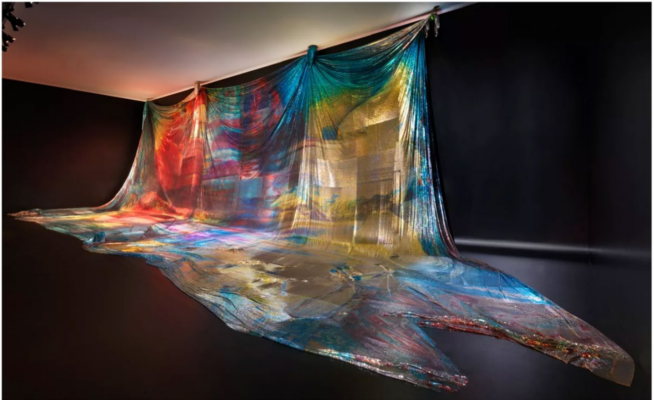
Installation view of Katharina Grosse Apollo Apollo at Espace Louis Vuitton Venezia.

German artist Katharina Grosse's theatrical new installation at Espace Louis Vuitton Venezia evokes a fluid, prismatic fabric that shrouds objects and prompts contemplation