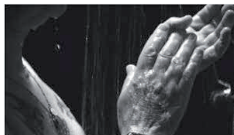
Opposite page As Heavy as Sculpture , 2021, installation view, 'Grief and Grievance: Art and Mourning in America', New Museum, New York