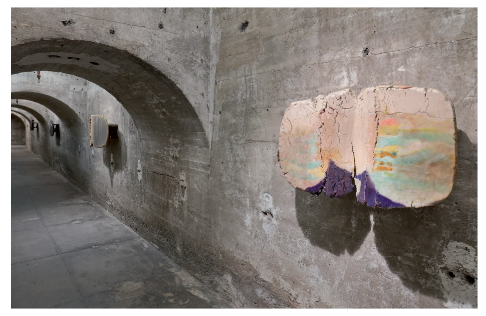
Some of Larner's recent wall-based works in ceramic, from right to left: "Marthe," 2019; "xiii (caesura)," 2014–15; "calefaction," 2015; "inflexion," 2013. Liz Larner; Cathy Carver

Although this body of work isn't included in the survey at SculptureCenter, it's hinted at in a gorgeously dystopian sequence of pieces made over the last decade and installed in the cryptlike basement galleries. Here, ceramic slabs encrusted with minerals and stones suggest extraterrestrial landscapes, or perhaps a post-Anthropocene view of our planet.