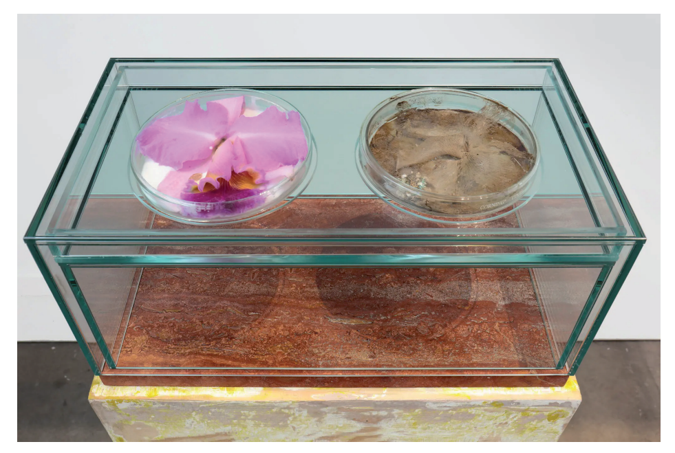
In "Orchid, Buttermilk, Penny" (1987), which takes the form of two petri dishes presented under glass, microorganisms ravage buttermilk, the petals of an orchid and a copper penny. Liz Larner; Cathy Carver

And in "2 as 3 and Some, Too" (1997-98), the steel frames of two open cubes — a form associated with the rigid geometries of Sol LeWitt, among others — seem to have been smooshed together as easily as one might crumple a foil candy wrapper. Larner has wrapped them in sheets of mulberry paper, which she has also tinted with watercolor in Easter-egg hues. The piece is large, measuring 137 inches at its widest point, but appears extremely delicate.