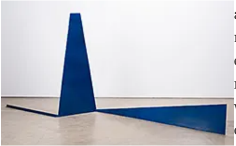
'Slow Movement', 1965 © Jonty Wilde

Caro leaps out as the radical he was: an artist who folded steel as if it were whipped cream