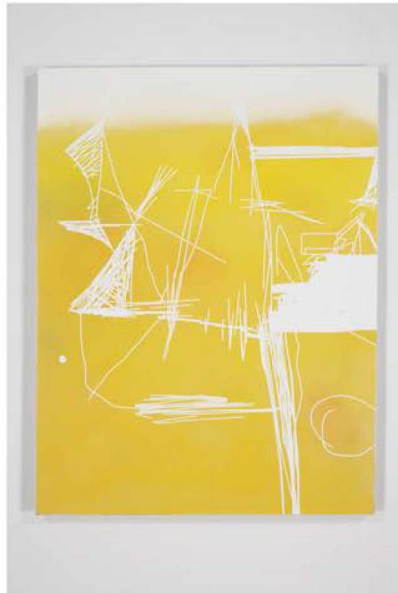
Mirage, 2011 Acrylic and ink on canvas 48 x 36 inches (121.92 x 91.44 cm)