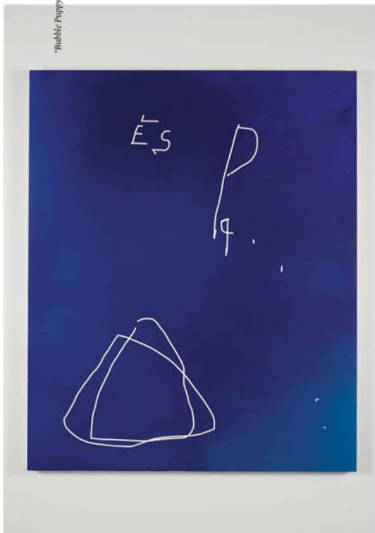
ESP (blue), 2013 Acrylic and enamel on canvas 72 x 59 inches (182.88 x 149.86 cm)

"Bubble Puppy"