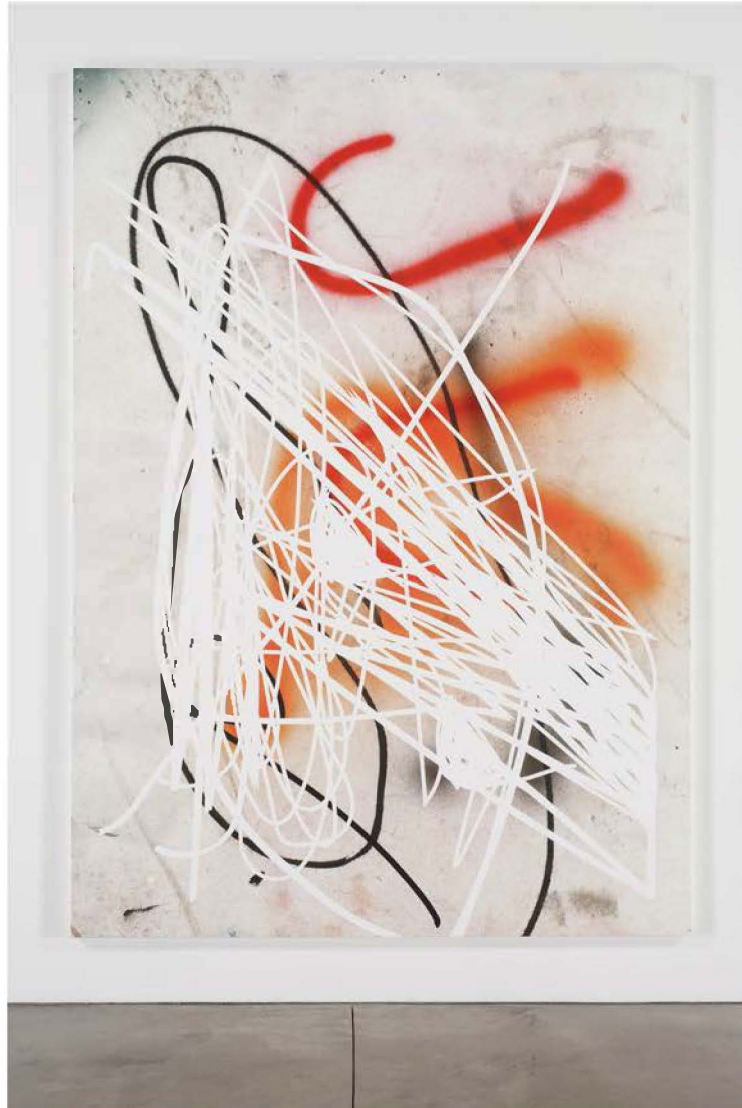
Buffalo Painting, 2014 UV ink on Fischer canvas 118 1/4 x 84 inches (300.36 x 213.36 cm)