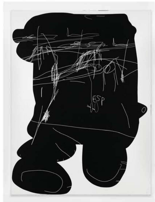
Bubble Puppy, 2013 Acrylic on canvas 244.2 x 188.3 cm (96 1/8 x 74 1/8 in)