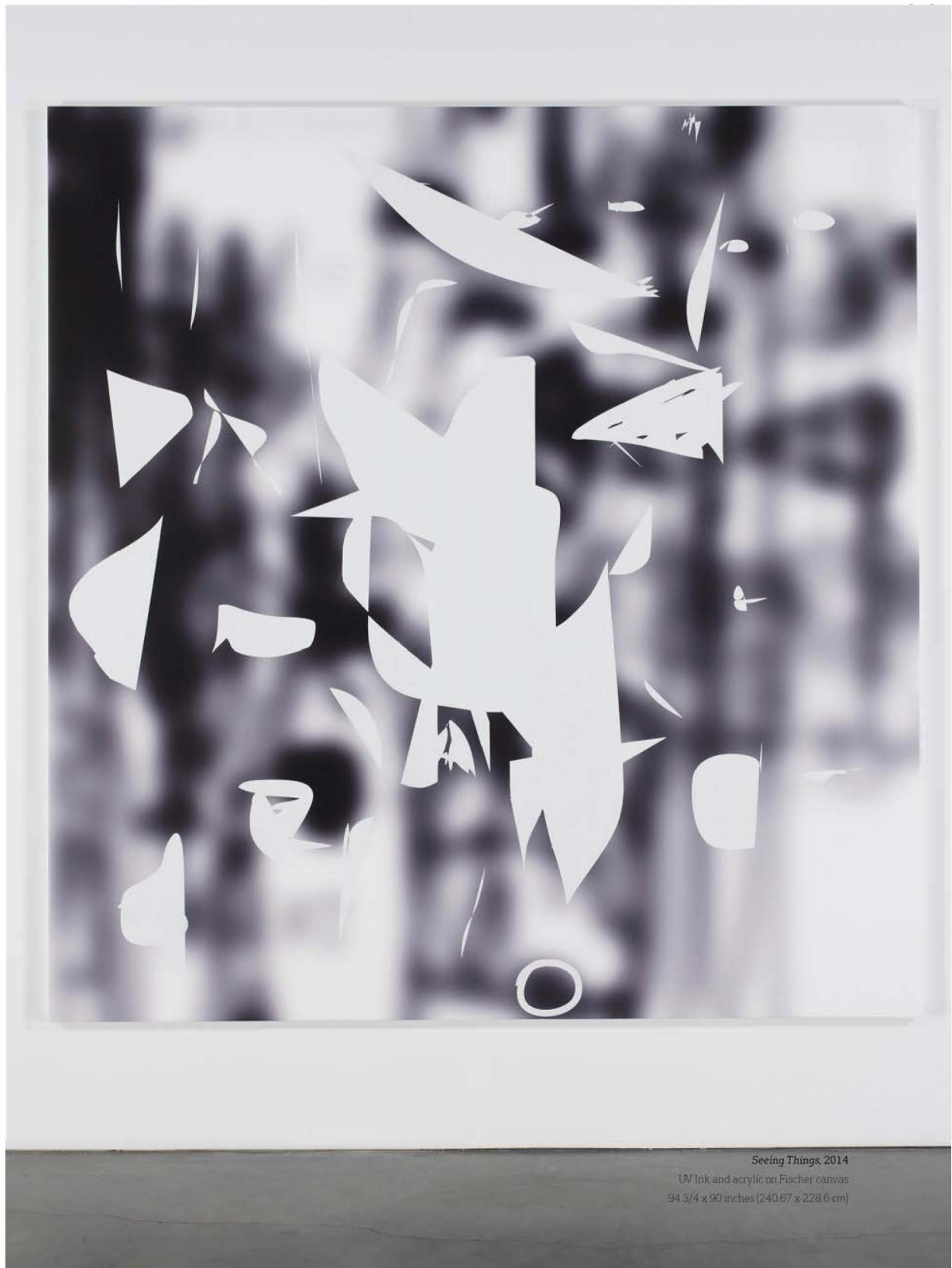
Seeing Things. 2014

UV Ink and acrylic on Fischer canvas 94 3/4 x 90 inches (240.67 x 228.6 cm)