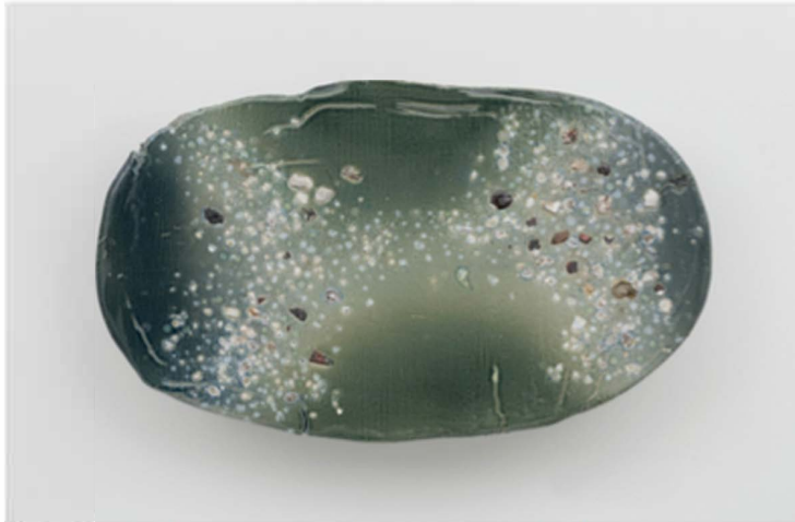
Lix Larner, "v (califaction)," 2015, ceramic, glaze, stones and minerals.

This is the first time the ceramics have really been shown exclusive of other non-ceramic works. Can you speak about how ceramic was first introduced to your practice? Why is this a material you are looking to explore? In what ways is ceramic most interesting for you?