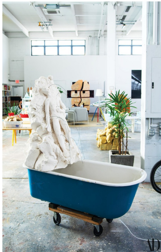
A plaster mock-up for a past project.

Fischer is also a provocateur. His Gagosian show in London featured a single subversive piece: an idealized sculpture of Dasha Zhukova, the glamorous cofounder of Moscow's Garage Museum of Contemporary Art—in the form of a candle. At the opening, the wick was lit, leaving the wax simulacrum of his friend to slowly melt into an abstract jumble of color over the course of the seven-week-long exhibition. Dasha is the latest in a series of candles of art-world icons, including Julian Schnabel and a copy of Giambologna's The Rape of the Sabine Women , that Fischer has both created and destroyed. Sometimes, he admits, his work is blatantly attention-seeking. "It doesn't just want to be there in the corner," he says.