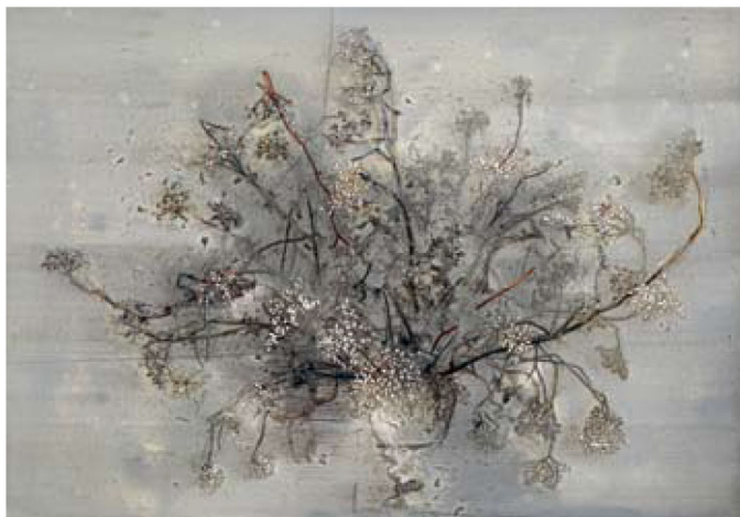
lust (2007), Acrylic and thread on canvas, 102 x 146 cm