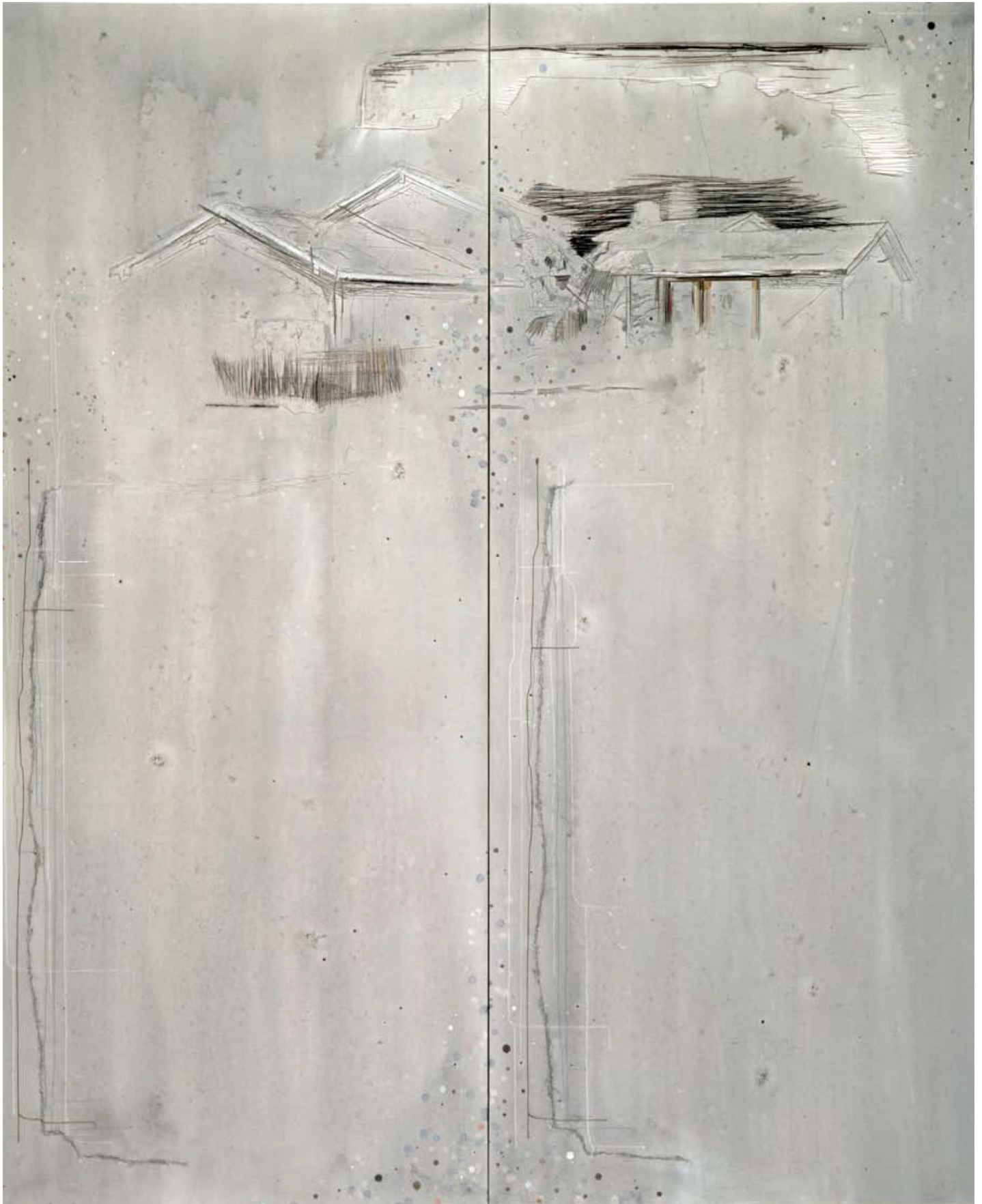
nameless (2007), acrylic and thread on canvas, 285 x 240 x 4.5 cm (2 parts: each 285 x 120 x 4.5 cm)