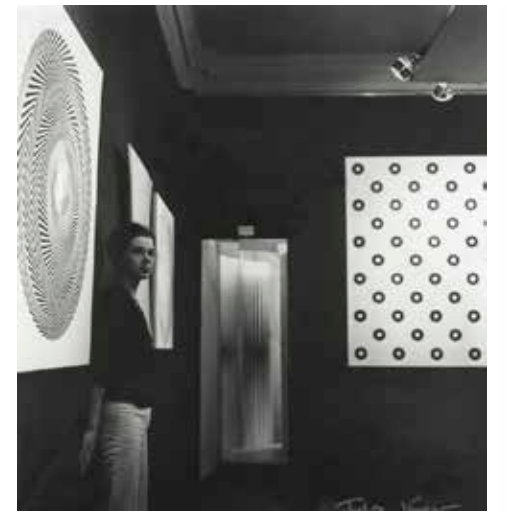
Bridget Riley in her second solo exhibition, 1963.

In the mid-1980s, Riley introduced parallelograms to her canvases, which slant like sun rays. Red Place (1987) features bricks in brilliant hues including rose, salmon, butterscotch, and aquamarine tilting towards the top right corner. The slight differentiation in the brick shapes, with large, single-hued patches in between, leaves the viewer's eyes dancing while attempting to find a pattern. The next decade brought new iterations on the parallelogram motif. Riley's blocky shapes adopted curved edges and began slithering across her canvases. One representative painting, Lagoon 2 (1997), features crescents and half-moons that fit together like puzzle pieces and evoke Henri Matisse's famous paper cut-outs. Riley had used curves since the 1960s, so the shift united decades of ideas into a logical step forward.