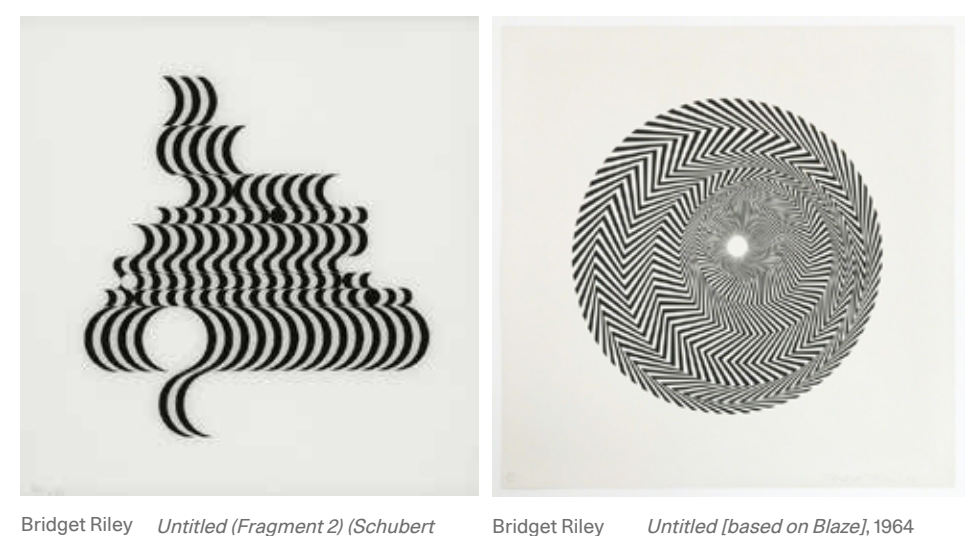
Bridget Riley Untitled (Fragment 2) (Schubert 5B), 1965, Sotheby's