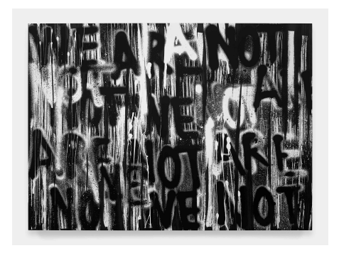
Adam Pendleton, Untitled (WE ARE NOT), 2021