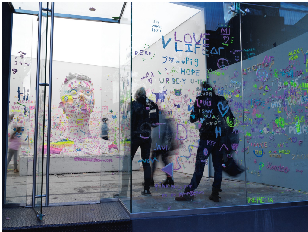
Urs Fischer, Bliss, 2017.

You also have a larger-than-life sculpture of Katy Perry—titled Bliss —that's currently on view in a public setting at 39 Spring Street in New York. How did this project come about?