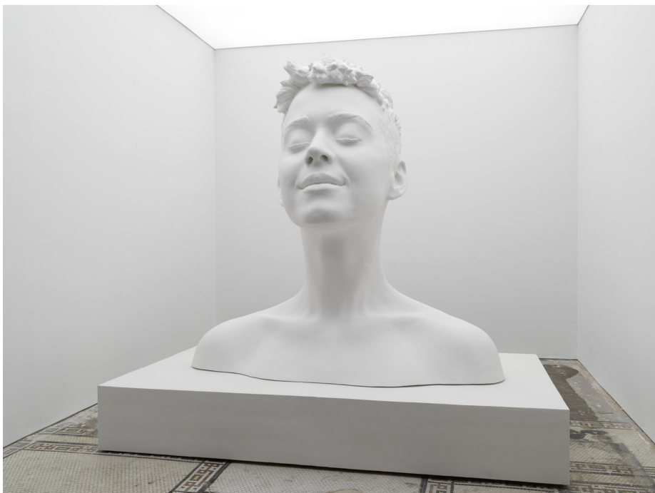
Urs Fischer, Bliss, 2017.

Why not? It's great. I think art fairs work best in insular settings, like in Basel, where there's not much else to do. I remember being in Miami Beach the first year and we were up on a walkway, where you could view the fair from above, and there was an agricultural fair on the other side at the same time. It was at that moment that I understood what it was. On one side there were artworks and on the other side there were tractors. You have a booth and you bring the thing you want to pitch and you meet people and you have a good time and then you go home. If you see it as anything more than that it can get depressing.