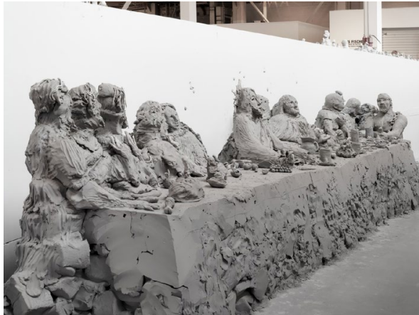
Urs Fischer and various artists, YES, 2011–ongoing. Courtesy of the artists. Photo: Stefan Altenburger

You've also made these crowd-sourced, participatory public pieces—most notably with your exhibition YES at LA MoCA. What is it about these kinds of works that you find appealing?