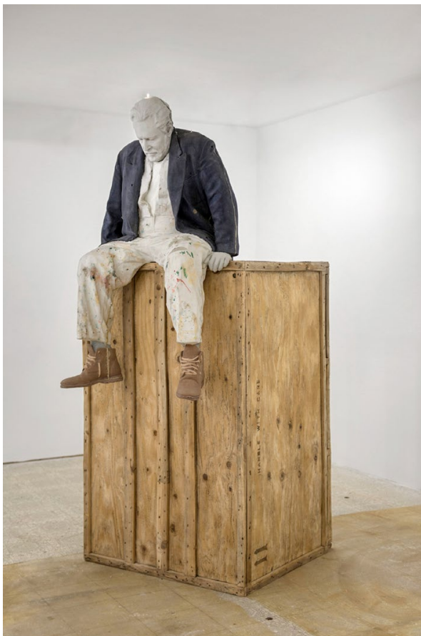
Urs Fischer, Julian, 2014. Courtesy of the artist and Karma, New York.

I don't know, we'll see. It's on view until the end of the year. People just walk in and start working on it. There are always people there, and it's mainly people that often never engage art. It's getting messy. In the end we'll probably see what we can recycle and the rest will go wherever.