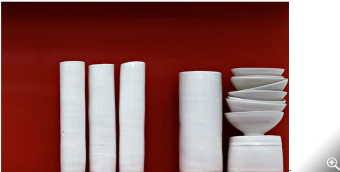
Detail of Edmund de Waal's Signs and Wonders , 2009. Click to enlarge. Photograph: H el ene Binet

The Guardian, Friday 2 May 2014 15.14 BST