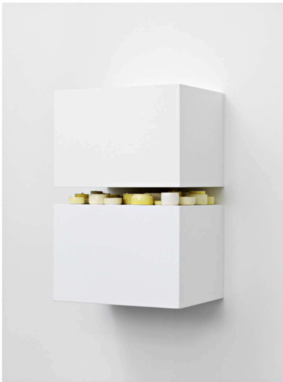
Edmund de Waal's

Tristia, 2007.