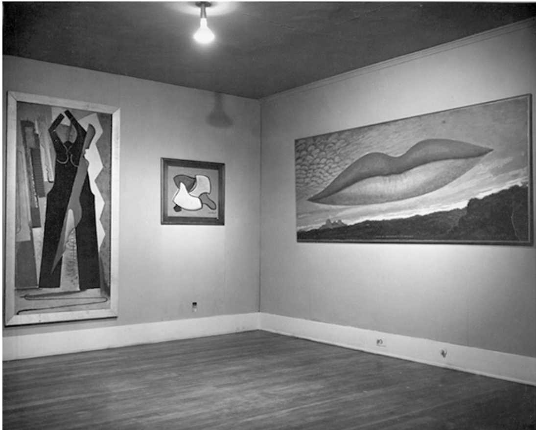
Man Ray exhibition at the Copley Galleries, ca. 1949.