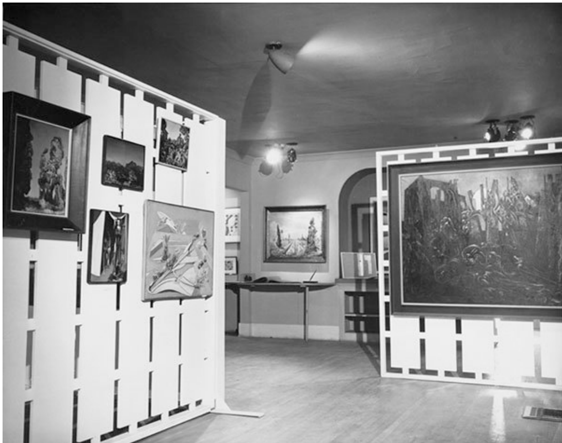
Max Ernst exhibition at the Copley Galleries, ca. 1949.