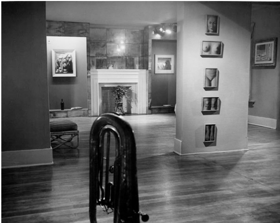
Rene Magritte exhibition at the Copley Galleries, ca. 1949.