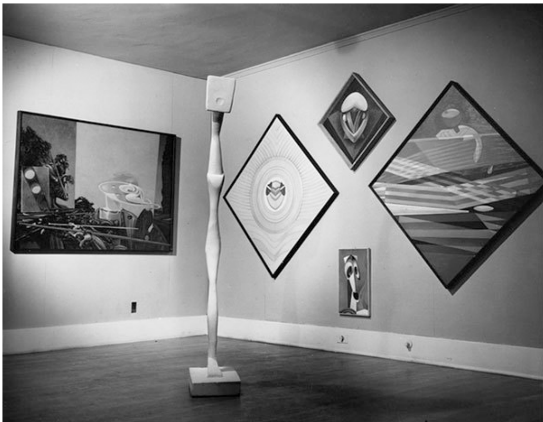
Max Ernst exhibition at the Copley Galleries, ca. 1949.

The Copley Galleries' accountant was reportedly "the unhappiest bookkeeper on the West Coast"; by spring of 1949, the evidence of the business's unviability was indisputable, and the gallery closed. 26 The Modern Institute of Art, similarly plagued by financial troubles, also closed its doors that spring.