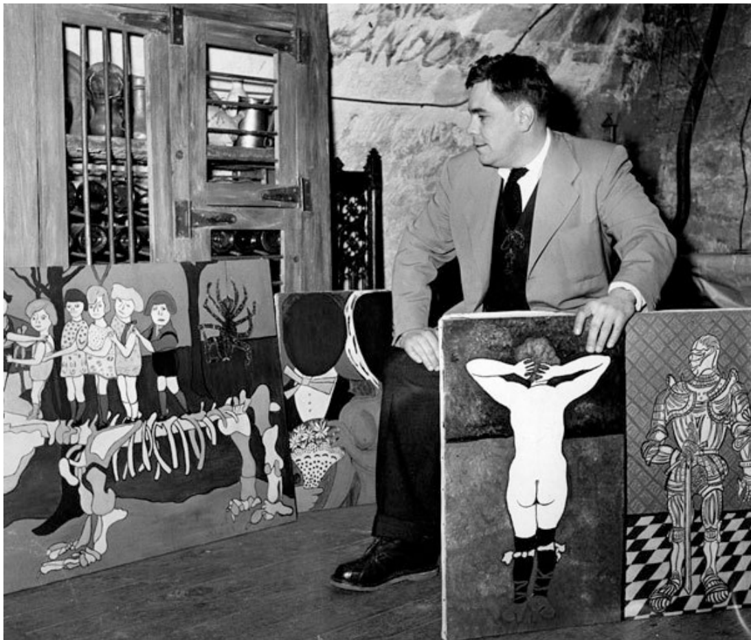
William N. Copley with his own paintings in Paris, 1951, two years after he closed the Copley Galleries and left Los Angeles.

“No one in their right mind would have considered trying to open a Surrealist gallery in the California environment, which, of course, is what we decided to do late one whiskied evening,” wrote the artist and collector William N. Copley. “In the white haze of the morning after, we were both too proud to perish the thought.” 1