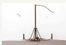
Liz Larner: Corner Basher , 1988, steel, electric motor, and speed control, 10 feet high.

Corner Basher sits in the lineage of kinetic art and institutional critique, but it came about after Larner attended a display of the outrageously macho robots that Mark Pauline presents under the name Survival Research Laboratories . "Look at all these guys with their remote controls, controlling these machines," she recalled in our conversation. "It's so lame. What we need is a machine people can control themselves." It is a nuanced update of, and an injection of ethics into, Chris Burden's Samson (1985), a jack that extends two timbers with increasing pressure against facing walls every time a visitor passes through a turnstile to enter the room. Instead of automatic force, Larner offers free agency. Corner Basher is a violent work, but one with a constructive side, as a generator of gestural wall sculptures that change swing by swing. No two successive viewers see quite the