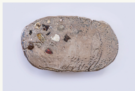
Liz Lerner: Distomunge , 2017, ceramic, glaze, stones, and minerals, 22 3/4 by 28 1/2 by 8 1/2 inches.