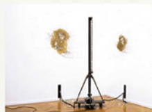
Liz Larner: Corner Basher , 1988, steel, electric motor, and speed control, 10 feet high.

After creating things that move and that die, Larner began embedding visual indeterminacy into static objects. I Thought I Saw a Pussycat (1997–98) is a tangle of blue and yellow translucent plastic links so intricately bound up that the eye cannot easily resolve it. The two crumbled, cube-like forms of 2 as 3 and Some, Too (1997–98)—made of steel rods wrapped in paper—shift in appearance as you circle them because of the unusual curves of their bars, and their paint jobs.