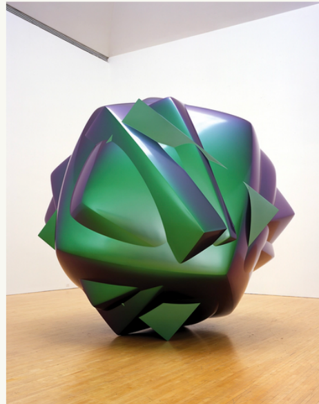
Liz Lerner: 2001, 2001, fiberglass, stainless steel, and automotive paint, 12 by 12 by 12 feet.

Lerner has committed herself to a restlessness that is rare and admirable and not without sacrifice. While other artists spend decades mining a given style or medium, she has been willing to abandon even the most fertile terrain in search of something new, again and again. This manner of operating, as motley as some of her sculptures themselves, has influenced a diverse range of artists, from Darren Bader to Anicka Yi to Matt Paweski.