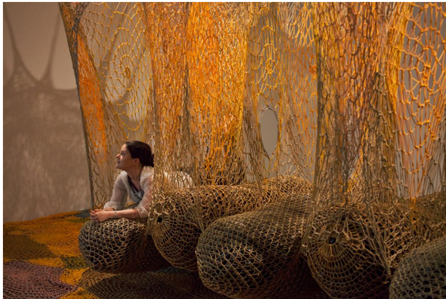
Ernesto Neto's Pele em fuga (2003)

Jochen Volz, the director of the Pinacoteca de São Paulo, is adamant that Ernesto Neto's art practice is not just centred on spectacle. The Brazilian artist is known for his large-scale, immersive multi-sensory installations incorporating materials and elements such as polyamide stockings, crocheted nets and spices and herbs. A selection of these, including Velejando entre Nós (2012-13), will feature in a 60-piece retrospective of the Rio de Janeiro-born artist's work at the Pinacoteca: Sopro [Blow] (until 15