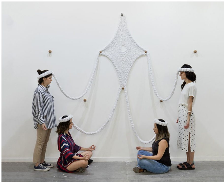
Ernesto Neto's Oxalá (2018)

“Visitors are invited to take off their shoes and enter the interior of the [Naves] sculptures suspended from the ceiling through a slot in a large organic vault. The sheer presence of the viewer within the work leads to its deformation. The observers become part of the sculpture, their bodies are inscribed in a comprehensive organism,” Volz says.