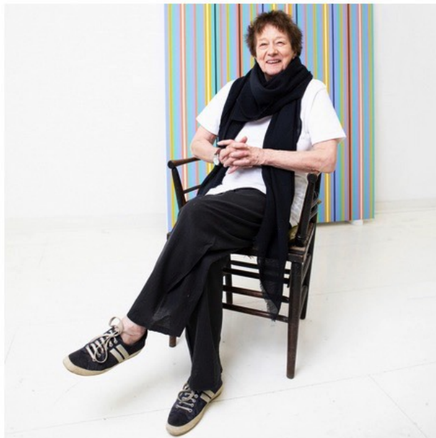
Bridget Riley in her London studio last month

However, while Riley speaks eloquently about sophisticated ideas and other artists, she refuses to be forthcoming about her own emotions or personal life. Tellingly, when she mentions a recent exhibition at David Zwirner's London gallery, she notes that the almost 8,500 visitors it attracted "didn't come to see me. They came to see my work. And I was pleased about that. Thrilled, in fact." Several paintings related to the works in that sell-out show – featuring coloured discs of muted purple, orange and green floating against white – surround us in the studio, propped against the whitewashed walls and protected by dust sheets.