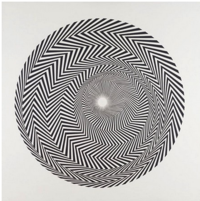
Bridget Riley's Blaze I (1962) features in a new exhibition at the Royal Scottish Academy