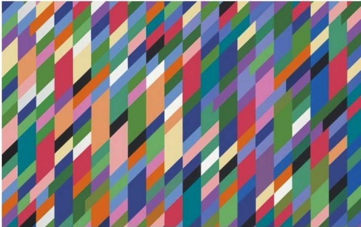
High Sky (1991, detail), a painting by Bridget Riley CREDIT: BRIDGET RILEY 2019