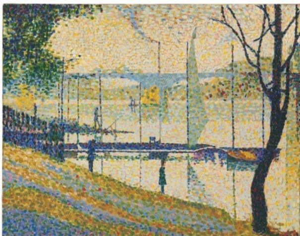
Copy after 'Le Pont de Courbevoie' by Georges Seurat, 1959

Riley’s breakthrough came in 1959, when she copied a reproduction of Seurat’s Bridge at Courbevoie (1886-87), which, she says, taught her about “colour and colour organisation”. While working in her first studio in Earl’s Court, she imitated Seurat’s pointillist technique in an important picture of her own, which she has called a “hinge painting”. Pink Landscape (1960), which is on show in Edinburgh, was designed, she says, to evoke the “particular sensation of light and heat” she experienced in Sienna, Italy.