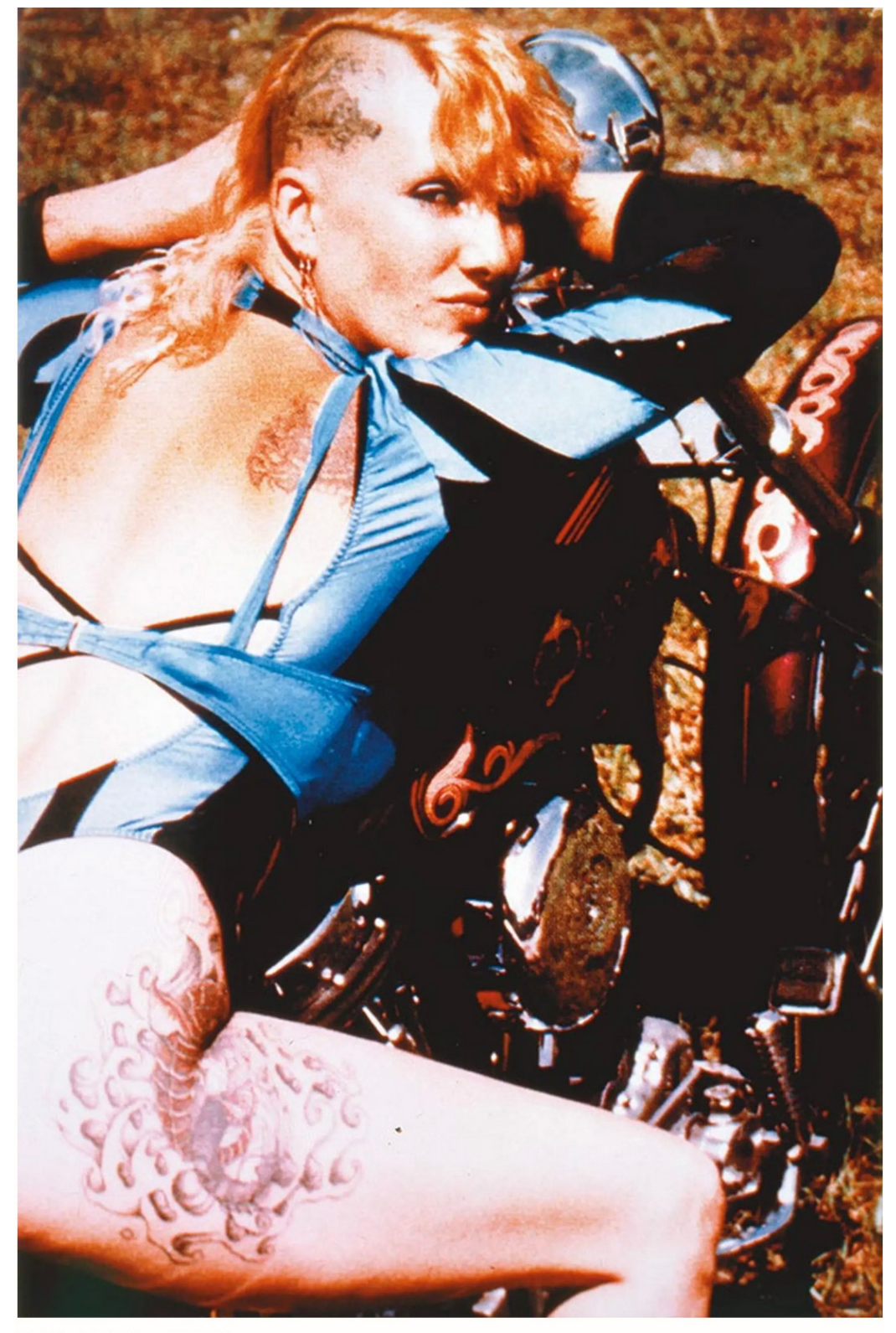
Untitled (Girlfriend) (1993)