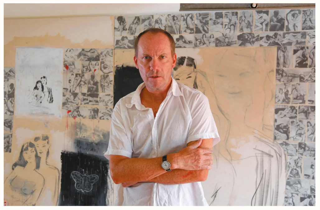
Richard Prince: "This could be only the second time my work has been shown with very little input from me"

Prince's new exhibition Same Man at the Louisiana Museum in Humlebæk, Denmark, features 89 works, including 60 on paper, and is his first presentation in Denmark. He spoke to The Art Newspaper about the exhibition and his work, in an office at the museum with a roaring fire and windows looking out onto the sea—a scene that recalled a Danish design fever dream.