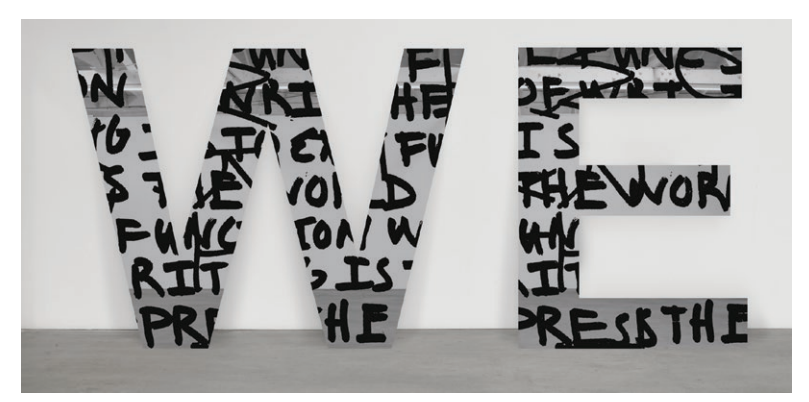
Adam Pendleton, WE (we are not successive), 2015. Silkscreen ink on mirror polished stainless steel. 46 13/16 \times 61 \ 1/2 \times 5/8 inches (W) 46\ 13/16 \times 35\ 5/8 \times 5/8 inches (E). Courtesy the artist.

What could I do that would actually change things around me, or change how we imagine the world and our built environment? Art was this thing that could shift attention.