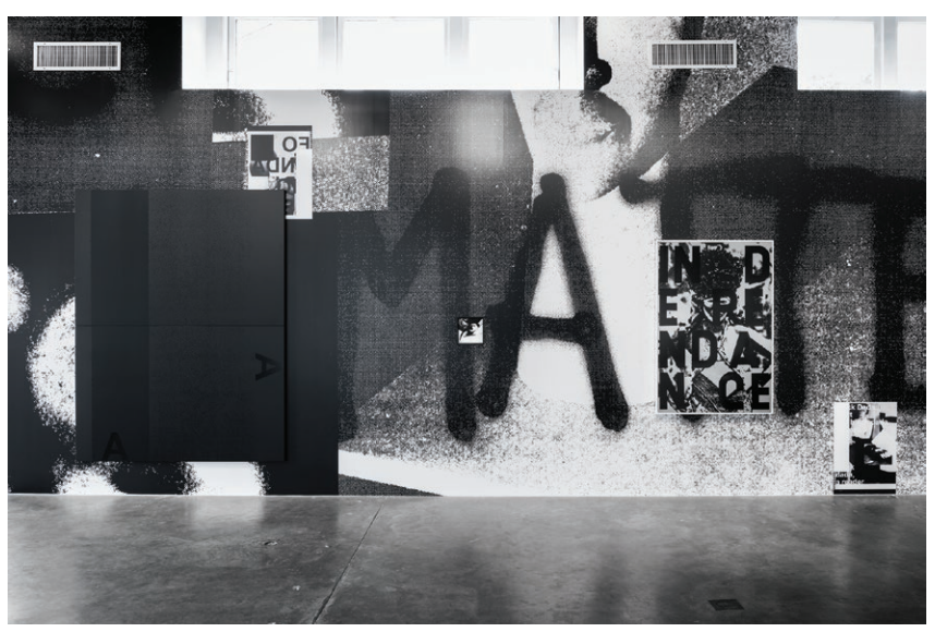
Installation view: Becoming Imperceptible, Contemporary Arts Center New Orleans, April 1 - June 1, 2016.

PENDLETON: That was when my own thinking about my work changed dramatically, yes. You have all of these ideas, and then you realize that what you make can't be a half-step toward those ideas. You actually have to manifest it. So I had this idea of taking a Southern-style religious revival, and turning it on its head, and then fusing it with experimental language. It was really that simple. I think it was the first time I had the idea to deconstruct, reconfigure, and reimagine an existing form and ask: what else could this be? What happens if you remove