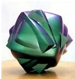
Untitled , 2001. Fiberglass, steel, and urethane paint, 144 x 144 x 144 in..

Collette Chattopadhyay: I thought we might start by discussing your new magnum opus, the huge Untitled (2001) multi-cubic form in the opening room of the MOCA show. How did you come to be interested in the cube to begin with?