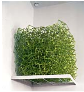
Ignis (Fake) , 1998–99. Aluminum, paper, watercolor, and steel, 32 x 32 x 34 in.

I don't know that the open (linear) forms are even cubes. They all measure the same, but can it be considered a cube when the lines aren't straight, perpendicular, and at right angles to each other?