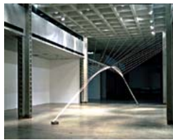
Bird in Space , 1989. Nylon cord sewn with silk and weighted with stainless steel blocks, dimensions variable.

LL: Yeah, you're right, and that's why I was interested in it. The cube itself symbolizes these things, but I don't know if they are possible. It's meant to symbolize a stasis or even stases that I don't believe really exist. I'm interested in being able to get away from that—to allow sculpture a physical manifestation in the third dimension that speaks about things that are not necessarily concrete. Like the idea that sculpture had come to represent security for some people, almost a physical security: the idea of stasis, which is appealing but not the nature of our world. "Attack" is maybe too strong a word, but using the term the way actors do, I was interested in an "attack" on the cube, opening it up and revealing its instability.