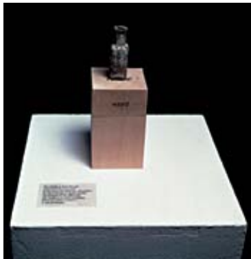
Something I Got Out of the Museum Here in L.A. , 1989. Glass vial on wood stand, 9 x 3 x 3 in. Materials found in the third pit during Chris Burden's Exposing the Foundations of the Museum at the Museum of Contemporary Art, Los Angeles.