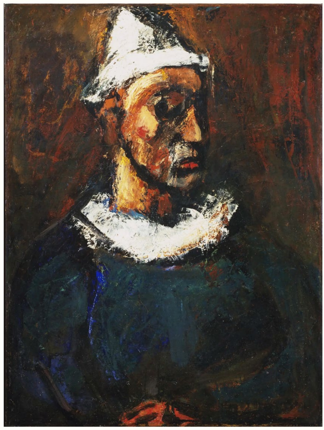
Georges Rouault, Clown (1912)