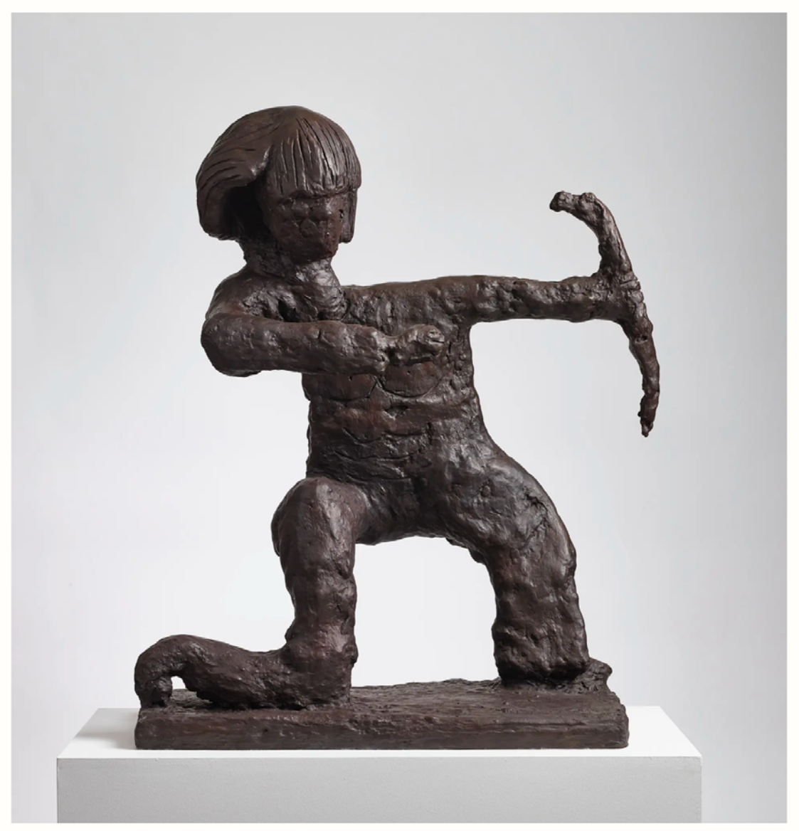
Tal R, Bow and Arrow, (2019)