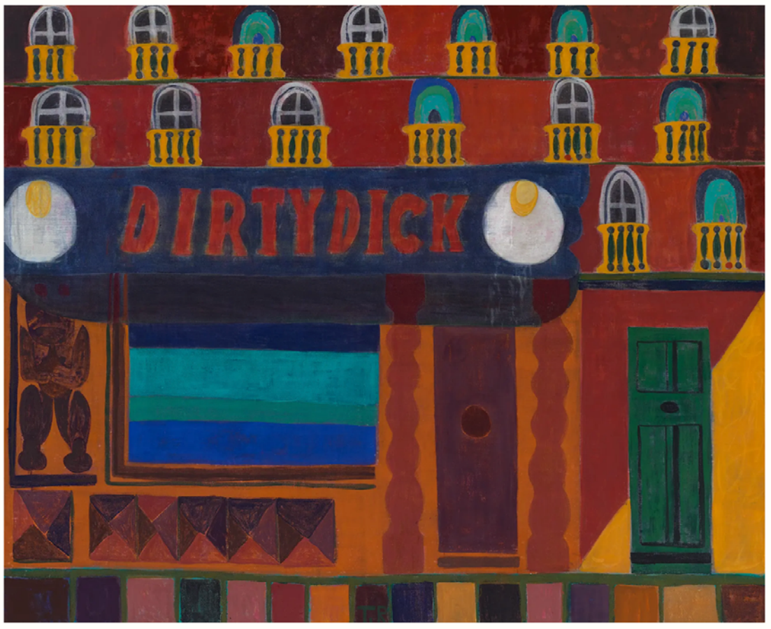
Tal R, Dirty Dick (2017)

"I think what I've taken from Rouault is banalities—that you don't need to tell very complicated stories, it's how you bend it. [...] Say it with a clown, with a nun, with Jesus, or with a man who's hanging from his neck. [...] I think the older you get, the less fear you have of these basic things. When you are a young artist, you want to invent everything. And you want to tell your story through very complicated narratives. As you get older you accept—maybe it's just a man on skis."