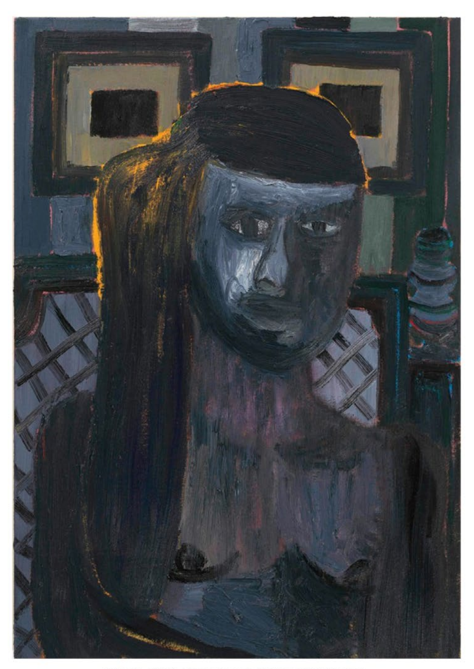
Blondie, 2014, oil on canvas, 38.62 x 26.75 inches.