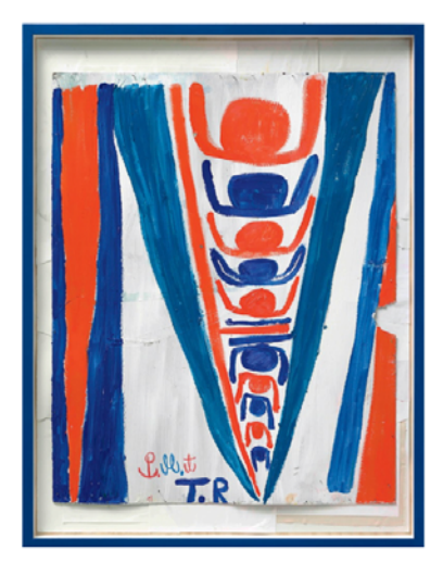
Fog Over Malia Bay, 2011, oil and dispersion on cardboard in artist frame, 47.5 x 36.5 inches.

Let me make an odd comparison. I have a very big dog that I've had for only a year. When you have a dog, you're always standing with other dog owners and they talk about what the dog is feeling. I think we have no clue what kind of feelings a dog has. When people look at paintings they also like to think the figures in the painting have feelings. I think that's all wrong. It's all banal projection. We have to