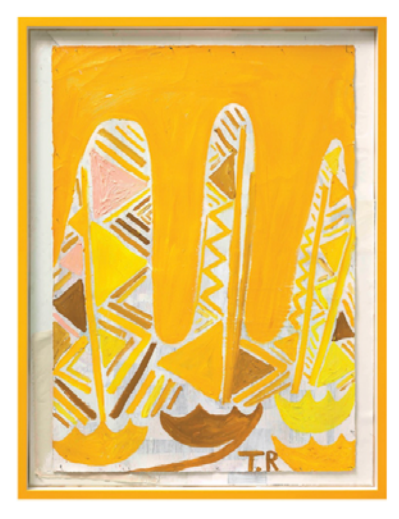
Fog Over Malia Bay, 2011, oil and dispersion on cardboard in artist frame, 47.5 x 36.5 inches.

I have actually done very deep art history, I've just never done it in an academic way. I've looked and looked and looked. So I could say that I have a deep knowledge, but it's all visual. When I go into museums, I never stay more than 45 minutes. I find postcards of my favourite works, go into the cafeteria, and sit and really chew on them. I try to take them apart so that I can understand them.