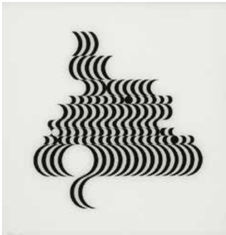
Bridget Riley Untitled (Fragment 2) (Schubert 5B) , 1965, Sotheby's