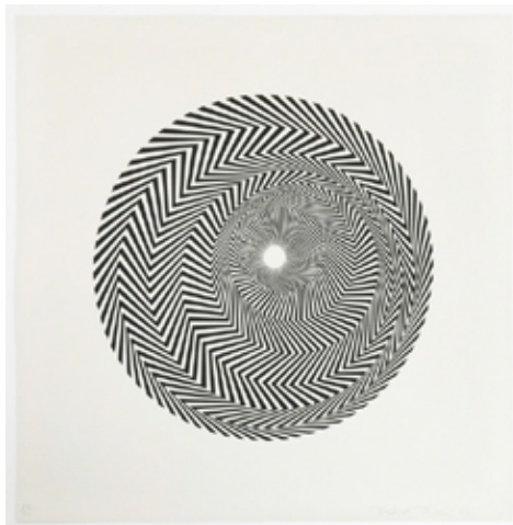
Bridget Riley Untitled [based on Blaze] , 1964 ARCHEUS/POST-MODERN