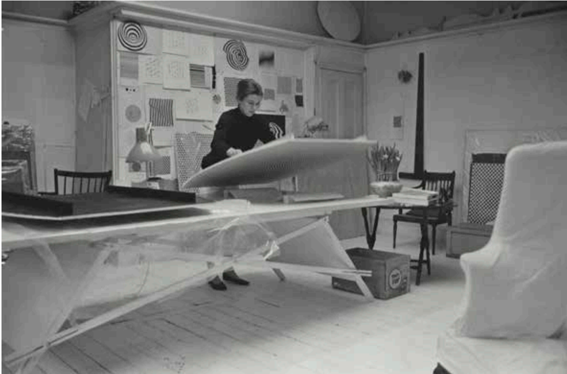
Bridget Riley in her Warwick Road Studio.