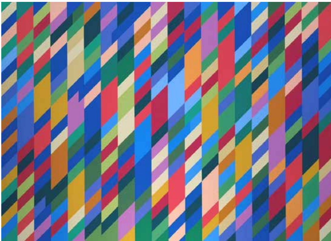
Bridget Riley Nataraja , 1993 Tate

While Op art has gone in and out of style, Riley herself is still working and is beloved on both sides of the pond. London's Hayward Gallery is displaying a major Riley retrospective through January 26th, celebrating over six decades of the artist's bold geometric abstractions. Her hard-edged shapes and brilliant palettes have given way to infinite possibilities on her canvases. Riley's work, which at first appears to be a collection of simple patterns, rewards sustained, careful looking; her work's genius lies in the way her compositions gradually reveal a vital, dynamic interplay of shape and color. Yet Riley's considerations reach far beyond the tricks and treats of optical games, urging viewers to rethink the way they see.