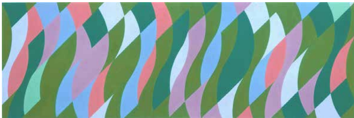
Bridget Riley Passing By , 2005 ARCHEUS/POST-MODERN

Over the decades, Riley has continued to innovate, pushing her practice forward while staying loyal to her perceptual interests. She’s developed one of the most recognizable styles—perhaps even a personal brand—in contemporary art: You know a Bridget Riley painting when you see it.