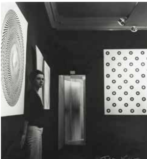
Bridget Riley in her second solo exhibition, 1963.

In the mid-1980s, Riley introduced parallelograms to her canvases, which slant like sun rays. Red Place (1987) features bricks in brilliant hues including rose, salmon, butterscotch, and aquamarine tilting towards the top right corner. The slight differentiation in the brick shapes, with large, single-hued patches in between, leaves the viewer’s eyes dancing while attempting to find a pattern. The next decade brought new iterations on the parallelogram motif. Riley’s blocky shapes adopted curved edges and began slithering across her canvases. One representative painting, Lagoon 2 (1997), features crescents and half-moons that fit together like puzzle pieces and evoke Henri Matisse’s famous paper cut-outs. Riley had used curves since the 1960s, so the shift united decades of ideas into a logical step forward.