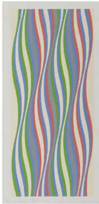
Bridget Riley Blue Dominance , 1977 ARCHEUS/POST-MODERN

British artist Bridget Riley, who is known for bold, blocky, and striped canvases of brilliant hues and contrasts, got her first taste of international celebrity back in 1965. Curator William Seitz included two of her paintings, Current (1964) and Hesitate (1964), in his groundbreaking exhibition at the Museum of Modern Art, titled “The Responsive Eye.” The eye-popping black-and-white squiggles of Riley’s Current adorned the catalogue cover, asserting Riley’s prominent position within the show. The exhibition situated her among an impressive roster of global artists whose artwork reconsidered ideas about perception. The group included American painters ranging from Morris Louis to Agnes Martin, along with Brazilian artist Almir da Silva Mavignier and a Spanish collective called Equipo 57. Along with Mavignier, Riley was considered part of a new wave of “Op artists” who exploited visual principles to make work that seemed to vibrate with new energy. Josef Albers, Salvador Dalí, and the museum-going public all swooned at Riley’s work.