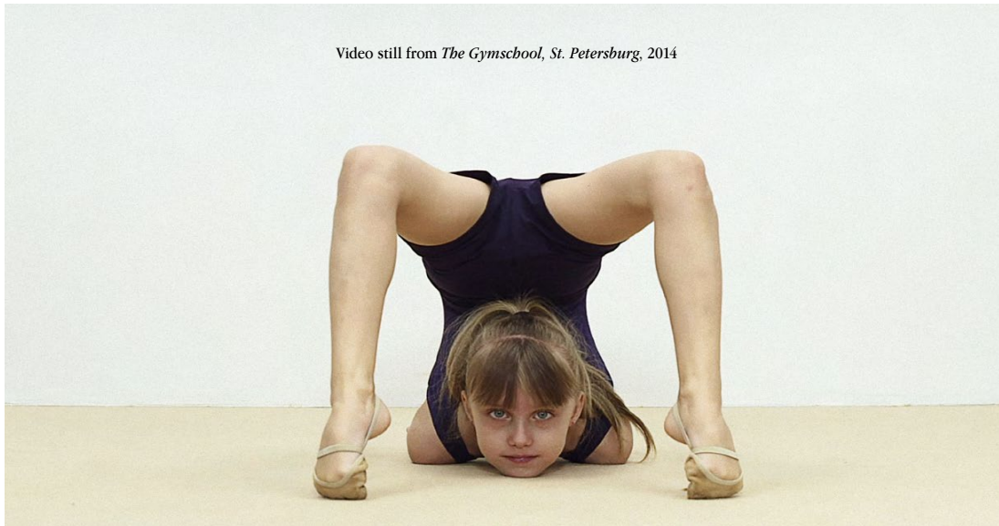
Video still from The Gymschool, St. Petersburg, 2014