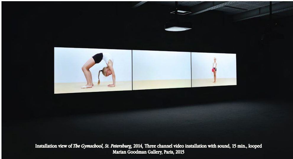
Installation view of The Gymschool, St. Petersburg, 2014 , Three channel video installation with sound, 15 min., looped Marian Goodman Gallery, Paris, 2015

Olga Korbut allegedly did more for democracy in fifteen minutes than two embassies could manage in five years – or at least, this is how Richard Nixon was reported to have congratulated the Soviet gymnast on her 1972 Olympic victory. The previous summer in Munich, the seventeen-year-old from Belarus entered the world arena like a national anthem. Her leotard is striking: bride white save for the varsity red cut of a polyester collar. In lieu of rhinestones, the image of a golden Soviet insignia patently printed onto her uniform boasts both an innovation in textile design and child psychology. Yet if Korbut had successfully convinced herself – as she'd convinced her spectators – that the image of a ribbon and medal printed on her uniform was, in fact, the one she'd brokered a lifetime on winning, her entrance onto the world stage would not have crumbled into such nervous error. She doesn't so much fall as she does catch the floor on the way up. Her mistake ricochets around the globe and leaves even the broadcaster stunned and disappointed. Upon having