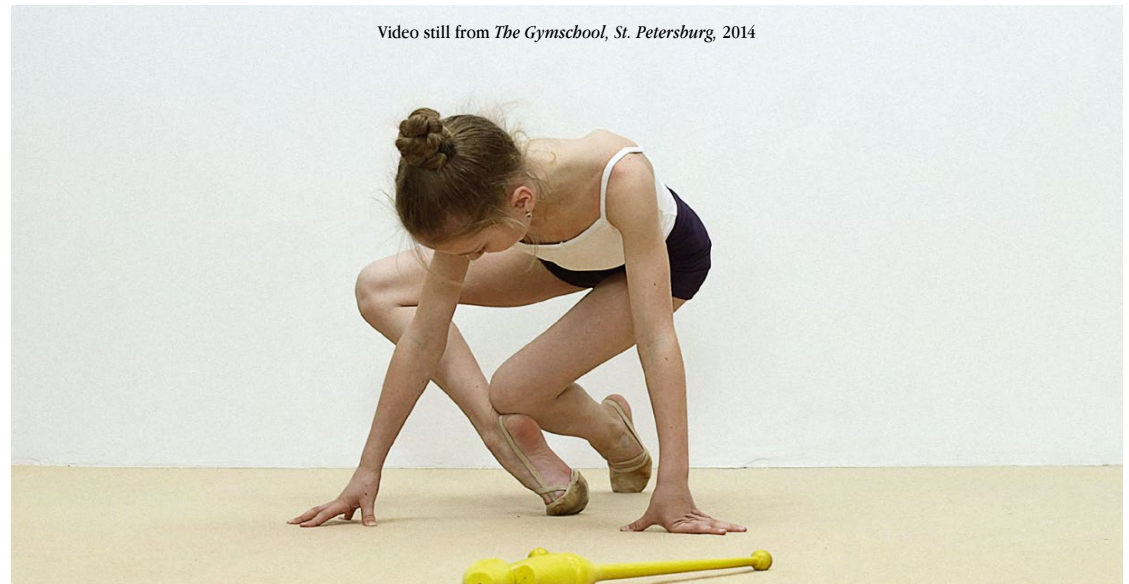
Video still from The Gymschool, St. Petersburg, 2014

One gets the sense that her individuality will be her ruin.