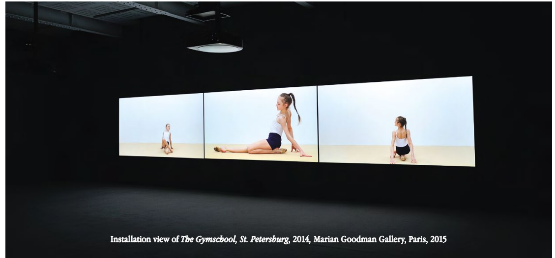
Installation view of The Gymschool, St. Petersburg, 2014 , Marian Goodman Gallery, Paris, 2015

The Gymschool renders visible the technolinguistics of sport and their libidinal re-engineering through which the body becomes apparatus to art. This moving image document of lithesome nymphets in states of machinic rapture is far from advocating some technopolitical drive towards a posthumanist end. Instead, Dijkstra’s lens seeks out that which is immanent in what might otherwise appear transcendent. The result is an image that lends itself better to a Kubrick film than any programme espousing progressive female social empowerment. For Dijkstra, this is an approach consistent with the Dutch tradition. Recall that Rembrandt’s paintings are the first modern miracles; how they occur as an art historical fork between History and Religious painting. At the same time, that kind of work tends to be popular, bourgeois, generic.