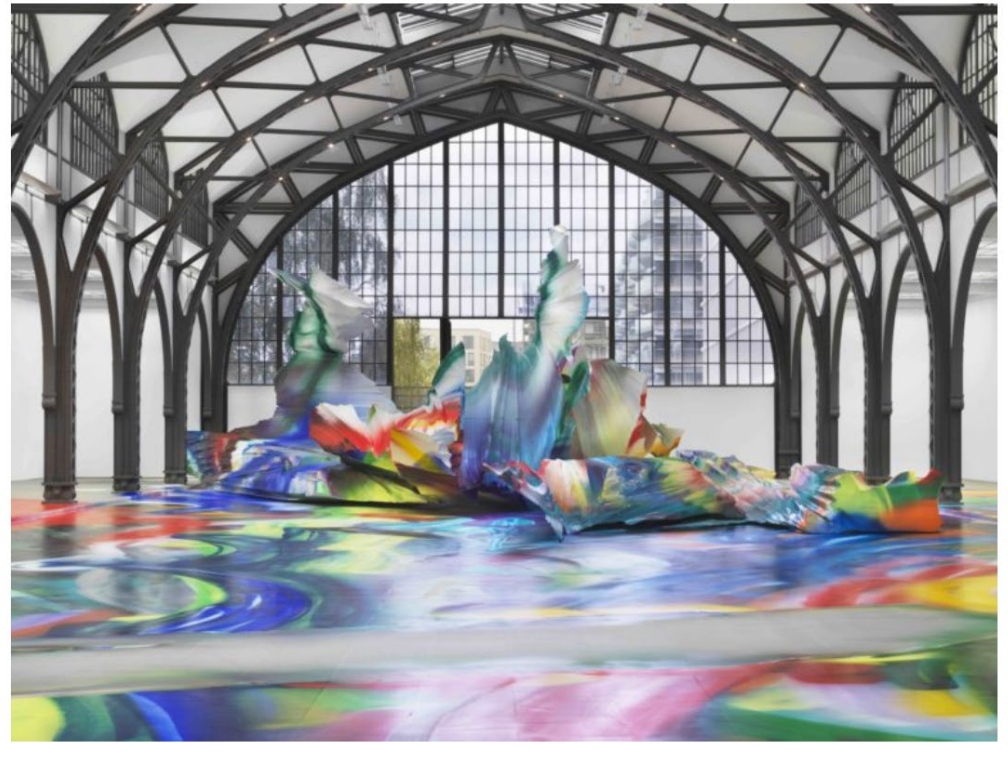
Katharina Grosse, "It Wasn't Us," 2020, Hamburger Bahnhof – Museum für Gegenwart – Berlin

KG: In early 2020, it gave me more time to paint my show for the Hamburger Bahnhof in Berlin. The museum became my studio for two months. I was also able to stay in my New Zealand studio for half a year, uninterrupted. But then, in the second year of the pandemic, everything became more chaotic, shows were postponed, and international collaborations were difficult with Zoom as the only meeting place.