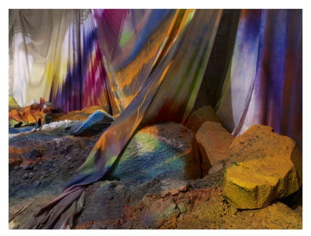
Katharina Grosse, "Untitled Trumpet," 2015, acrylic on wall, floor, and various objects, 259 3/4 x 826 3/4 x 511 3/4 inches, courtesy of Venice Biennale, Barbara Gross Galerie, Galerie nächst St. Stephan Rosemarie Schwarzwälder, König Galerie, and Galerie Mark Müller

WW: You've said that there's no distinction between painting, sculpture, and architecture. How so?