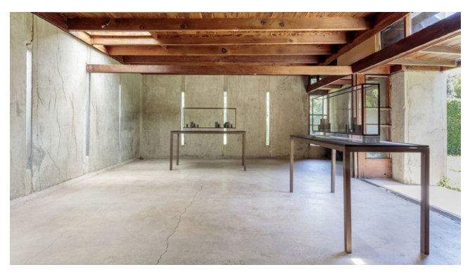
Edmund de Waal, "case study #2, 2015," 14 porcelain vessels and 3 Cor-Ten steel Blocks in steel and plexiglass vitrine.

MAK Center at the Schindler House, 835 N. Kings Road, West Hollywood, (323) 651-1510, through Jan. 6. Closed Monday and Tuesday. makcenter.org