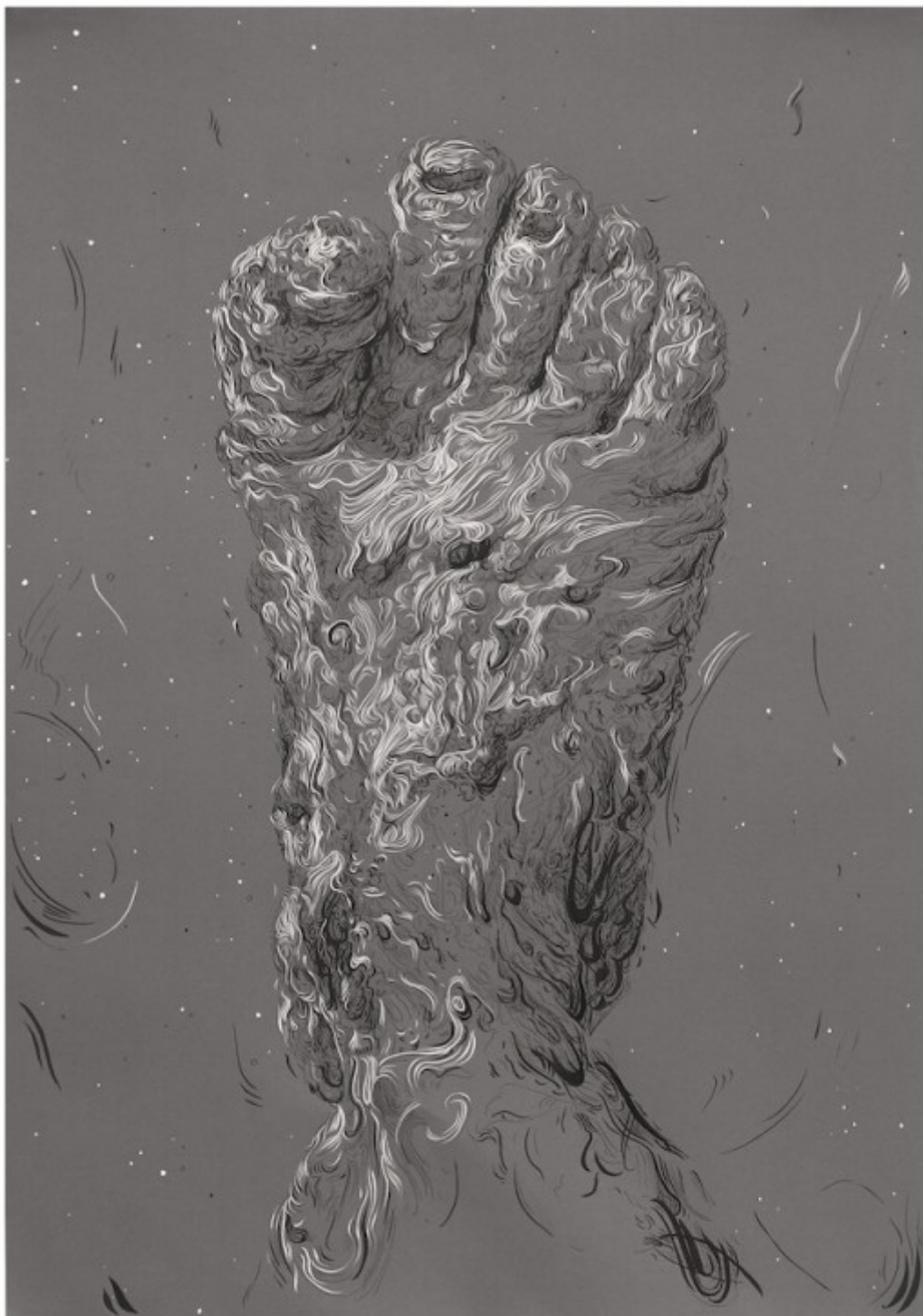
Glenn Brown, "Drawing 27 (after Menzel)", Indian ink and acrylic on paper, Canford Gun Metal, 84 x 59 cm, 2015 (Courtesy the artist and Galerie Max Hetzler Berlin | Paris.)

When asked whether his newfound interest in drawing has changed his painting practice, Brown was adamant that drawing had fundamentally changed how he approached painting and that he can no longer return to how he painted previously.