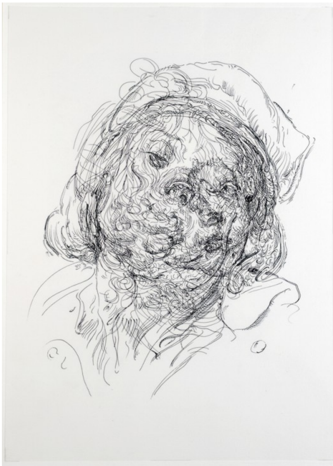
Glenn Brown, "Drawing 40 (after Greuze/Jordaens)", ink on polypropylene over Indian ink on paper, 50 x 36 cm, 2014 (Courtesy the artist and Galerie Max Hetzler Berlin | Paris.)

himself by turning his hand to drawings on paper and polypropylene. Some 24 images derived from the work of master draughtsmen, including Giovanni Battista Tiepolo, (1696-1770), Françoise Boucher (1703-1770), Delacroix, Jean-Baptiste Greuze (1725-1825), Eugène Delacroix (1798-1863),