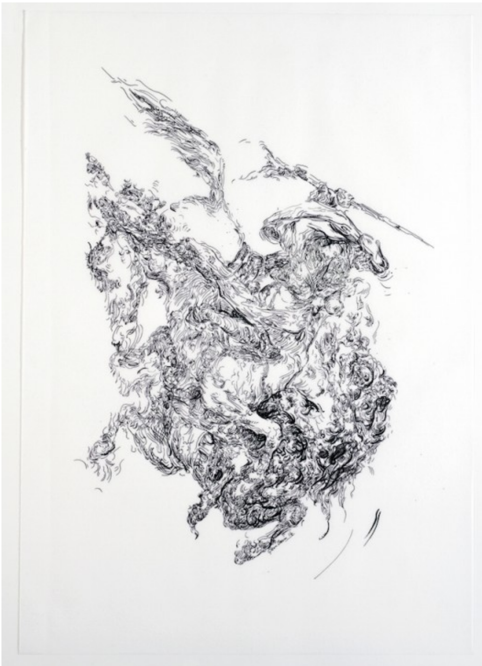
Glenn Brown, "Drawing 50 (after Delacroix)", Indian ink on Pergamenta White 160 paper, 50 x 35 cm, 2014 (Courtesy the artist and Galerie Max Hetzler Berlin | Paris.)