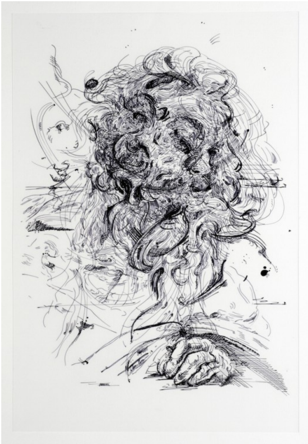
Glenn Brown, "Drawing 26 (after Strozzi/Strozzi)", ink on polypropylene, 44,1 x 30 cm, 2013 (Courtesy the artist and Galerie Max Hetzler Berlin | Paris.)