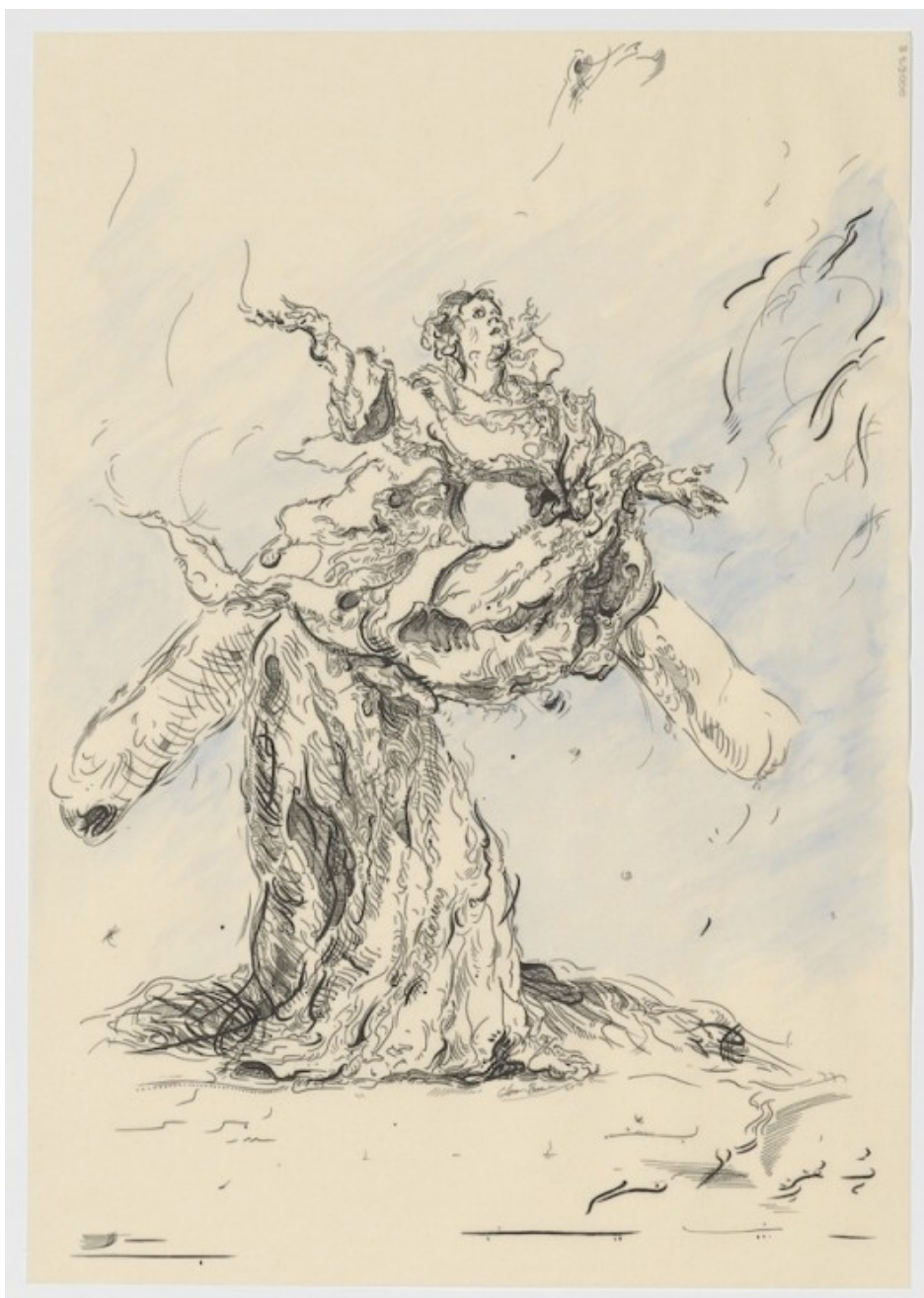
Glenn Brown, "Drawing 8 (after Murillo/Murillo)", Indian ink and watercolour on paper, Pergamenata Natural, 50 x 34,7 cm, 2015

randian Christopher Moore 7 September 2015