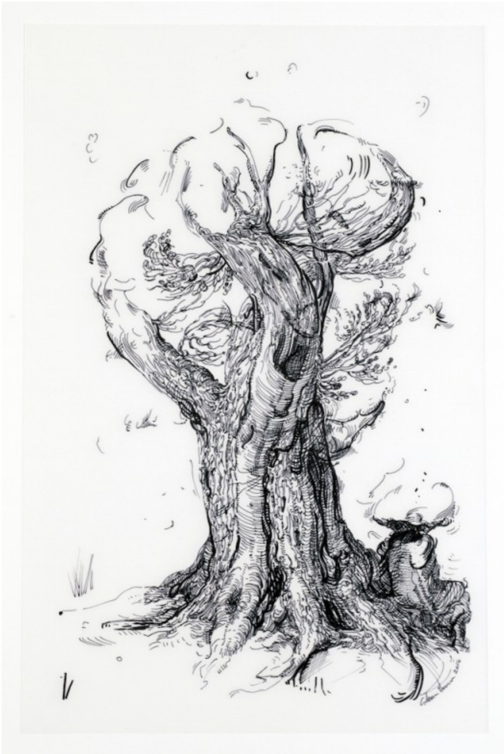
Glenn Brown, "Drawing 31 (after De Gheyn II)", ink on polypropylene, 37 x 24,1 cm, 2014 (Courtesy the artist and Galerie Max Hetzler Berlin | Paris.)